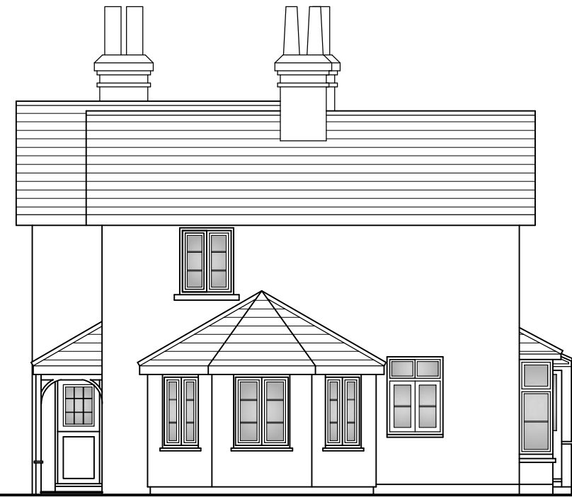
EXISTING SE SIDE ELEVATION