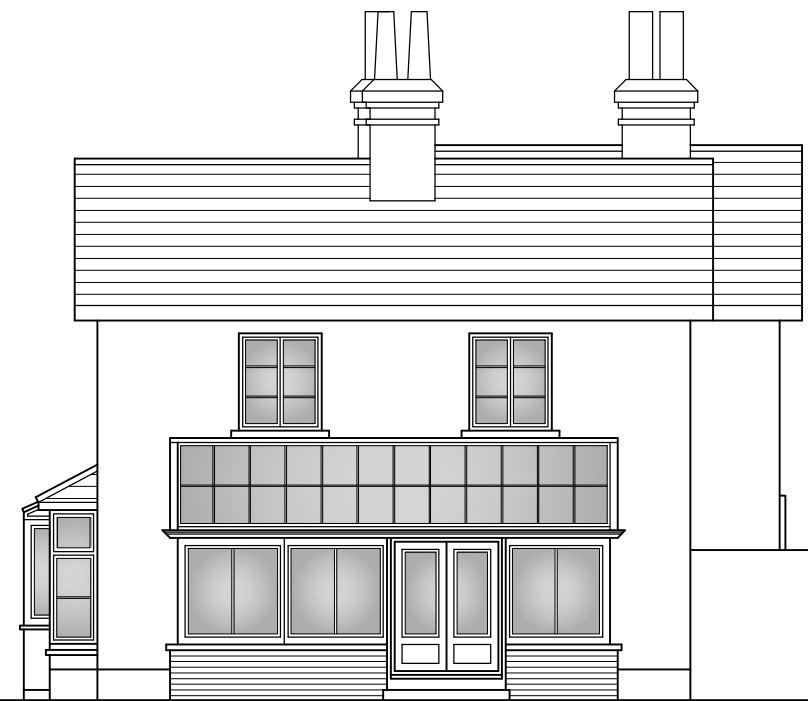
EXISTING NW SIDE ELEVATION