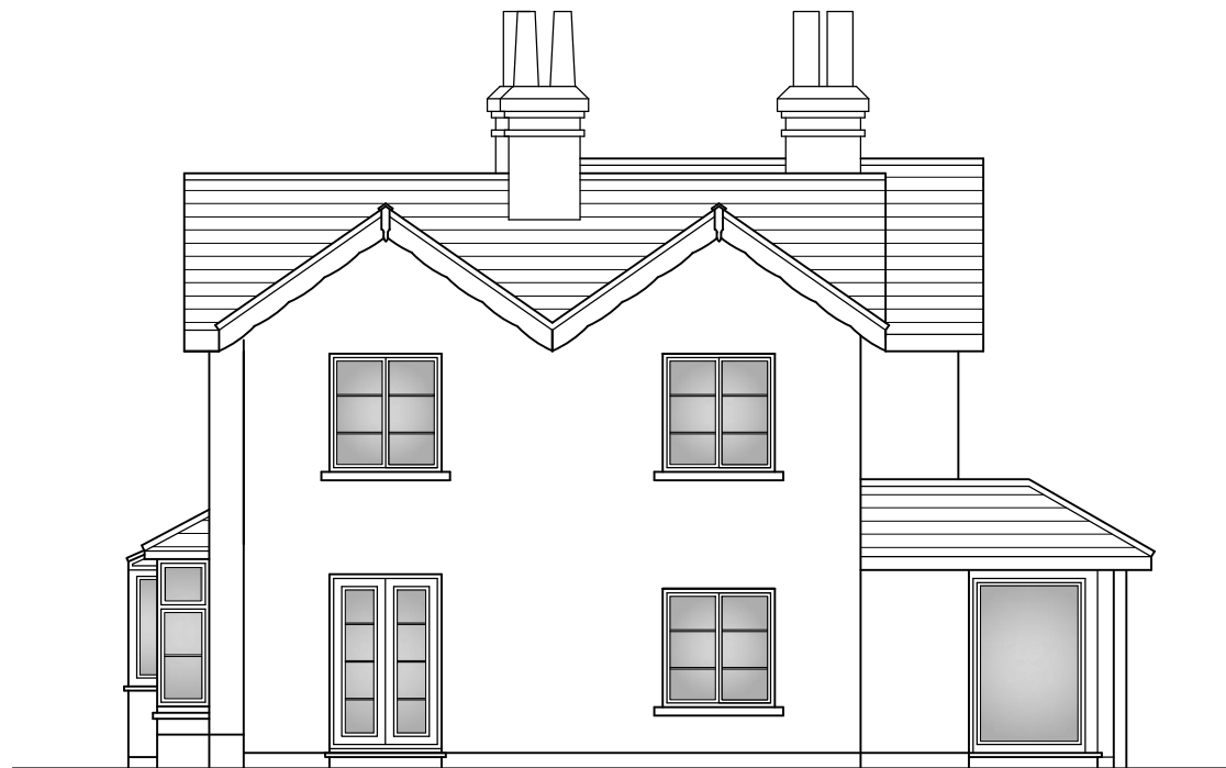
PROPOSED NW SIDE ELEVATION