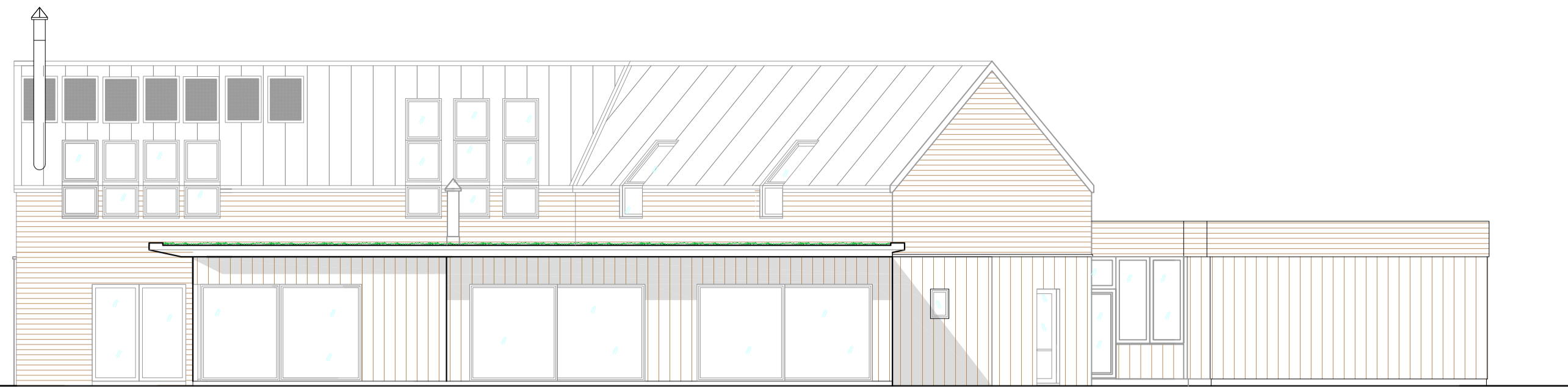
Proposed South West Elevation 1:100