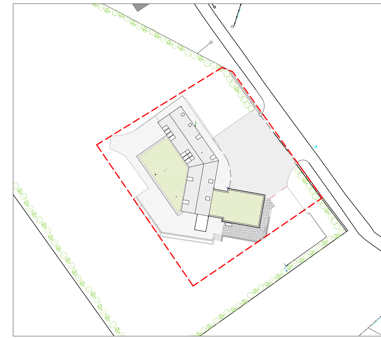
Proposed Site Plan 1:500 Site Area - 1144m 2