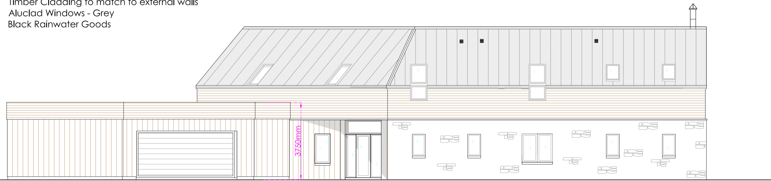
Proposed North East Elevation 1:100

Timber Cladding to match to external walls Aluclad Windows - Grey Black Rainwater Goods