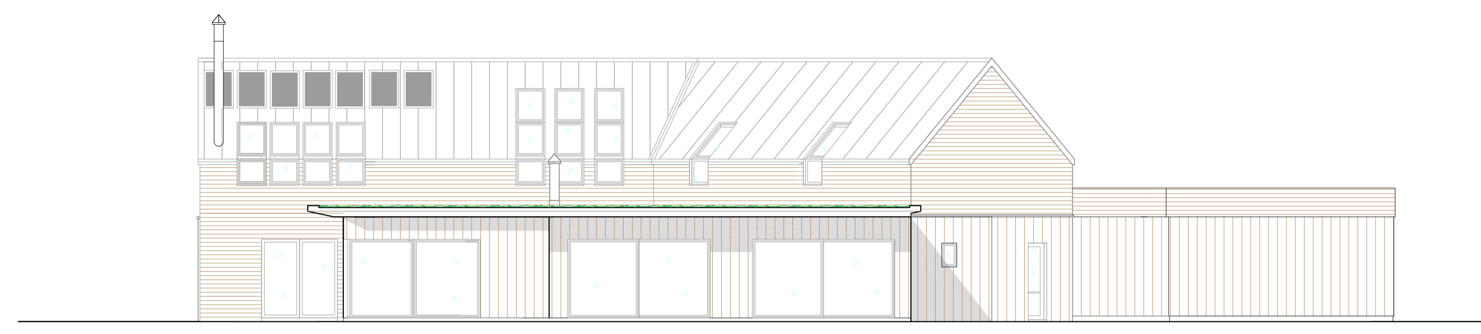
Existing South West Elevation 1:100