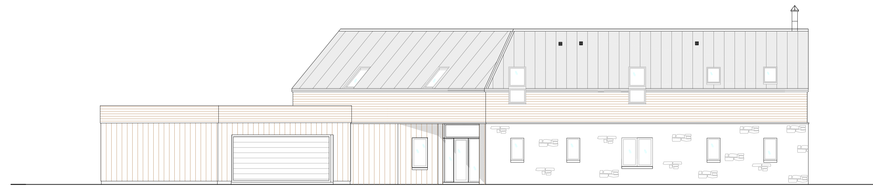
Existing North East Elevation 1:100