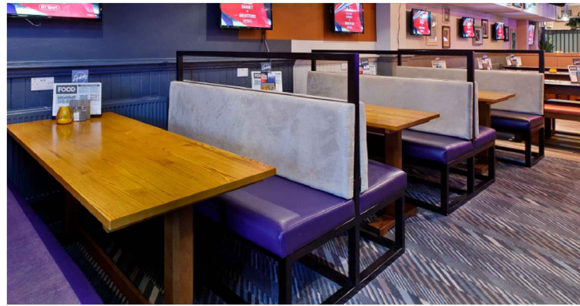
FS2 DINING HEIGHT BOOTHS - REFERENCE PHOTO