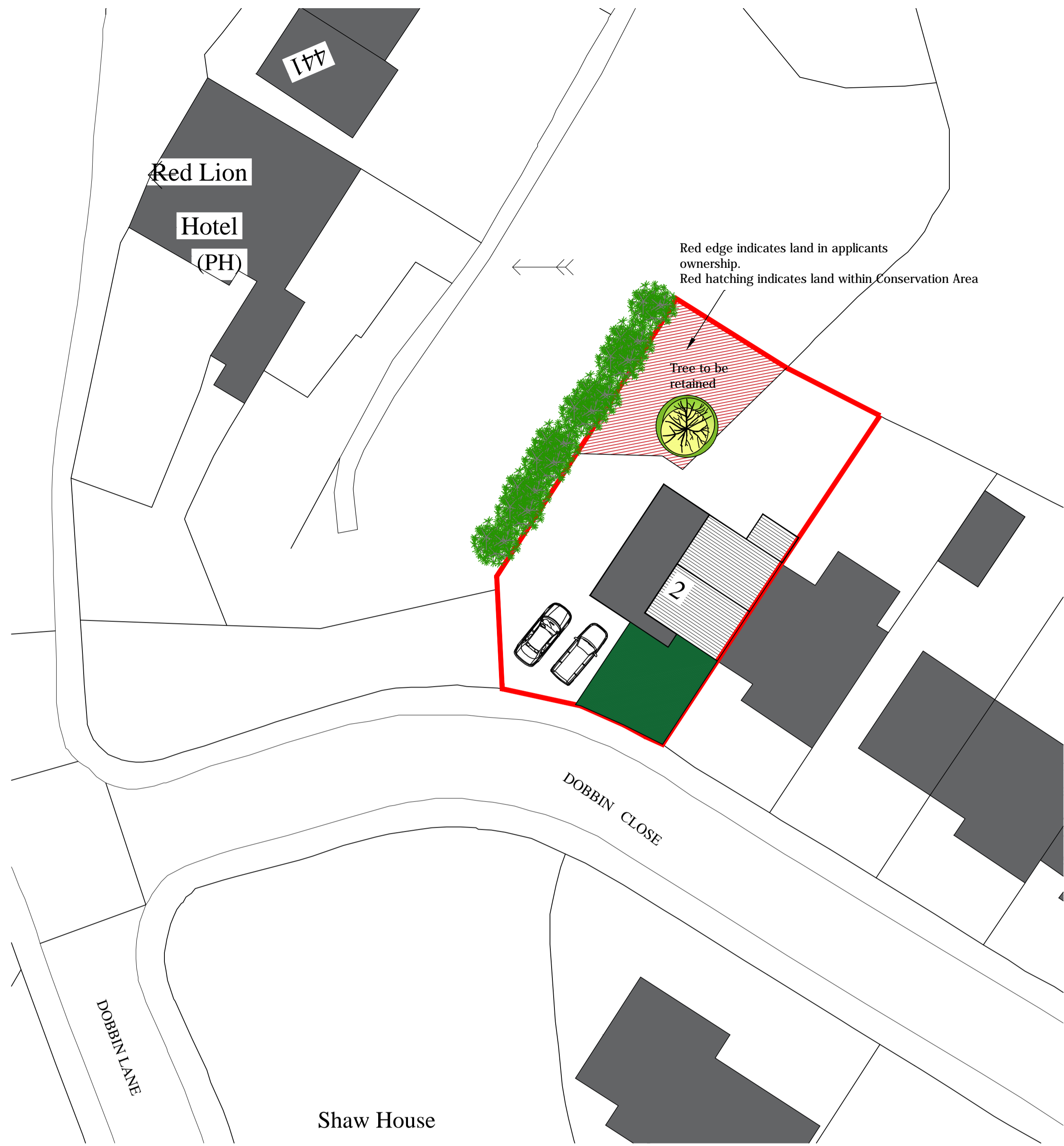
Existing Block Plan (1:200)