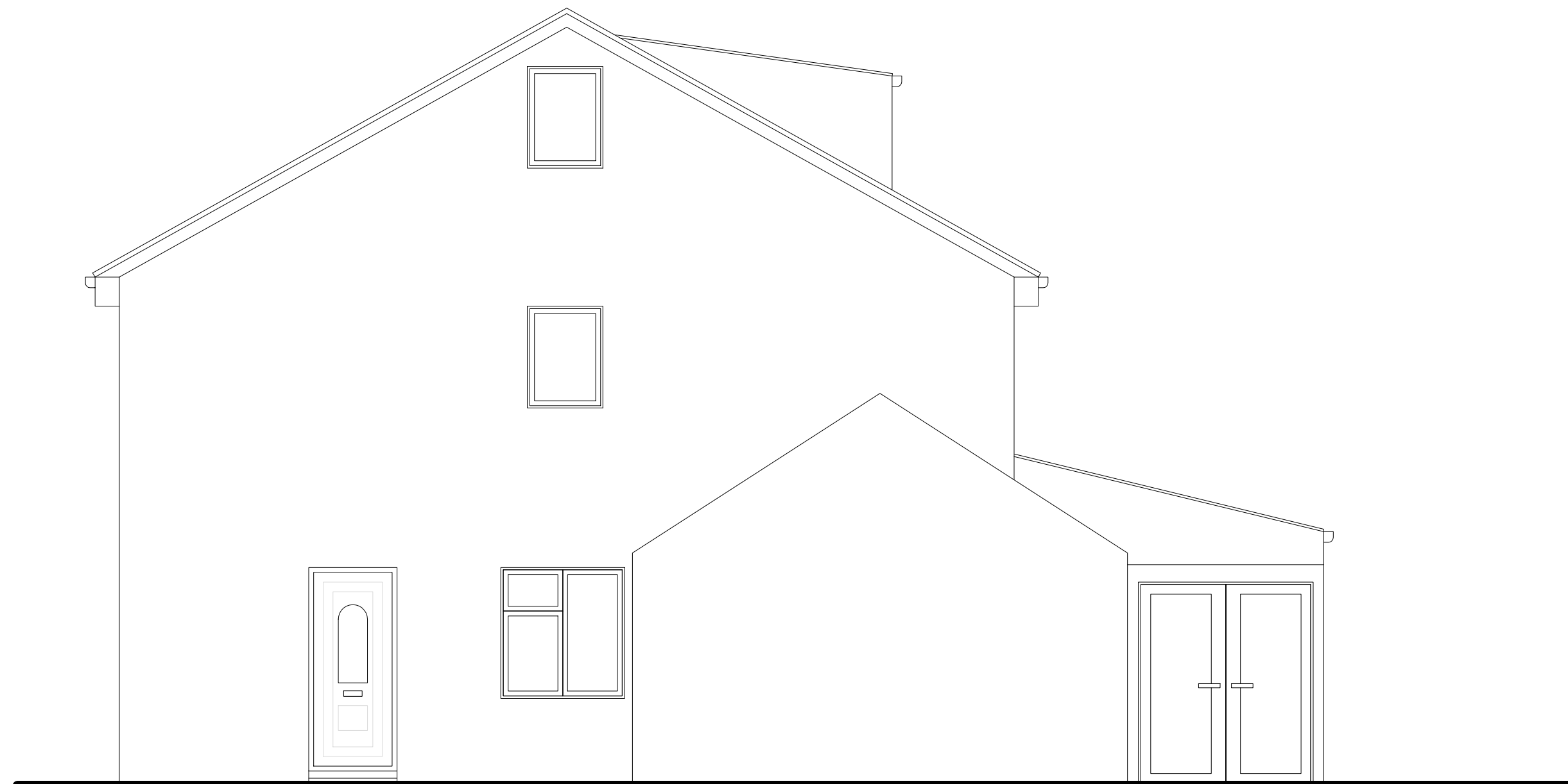
EXISTING SIDE ELEVATION Scale 1:50