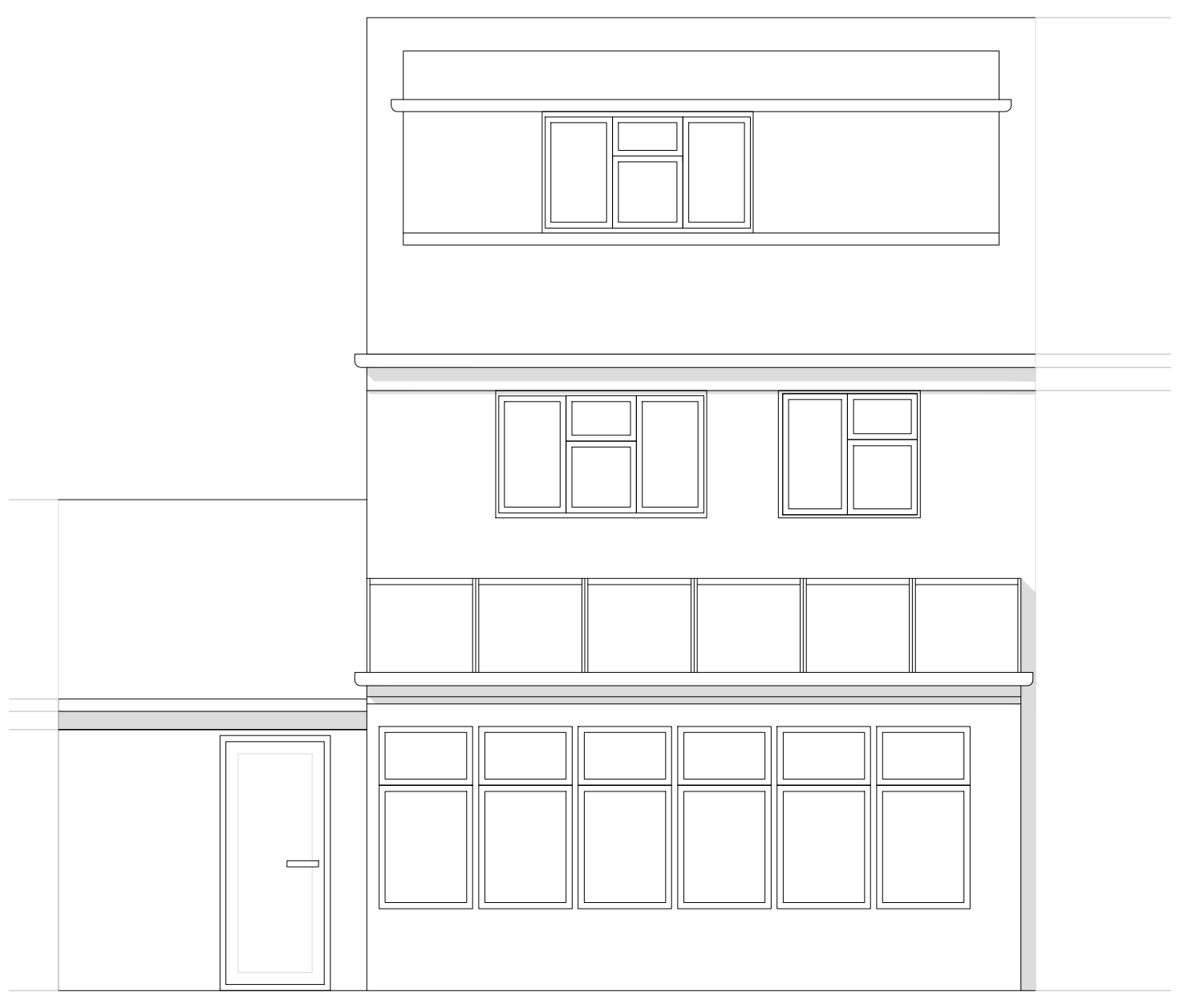
EXISTING REAR ELEVATION Scale 1:50