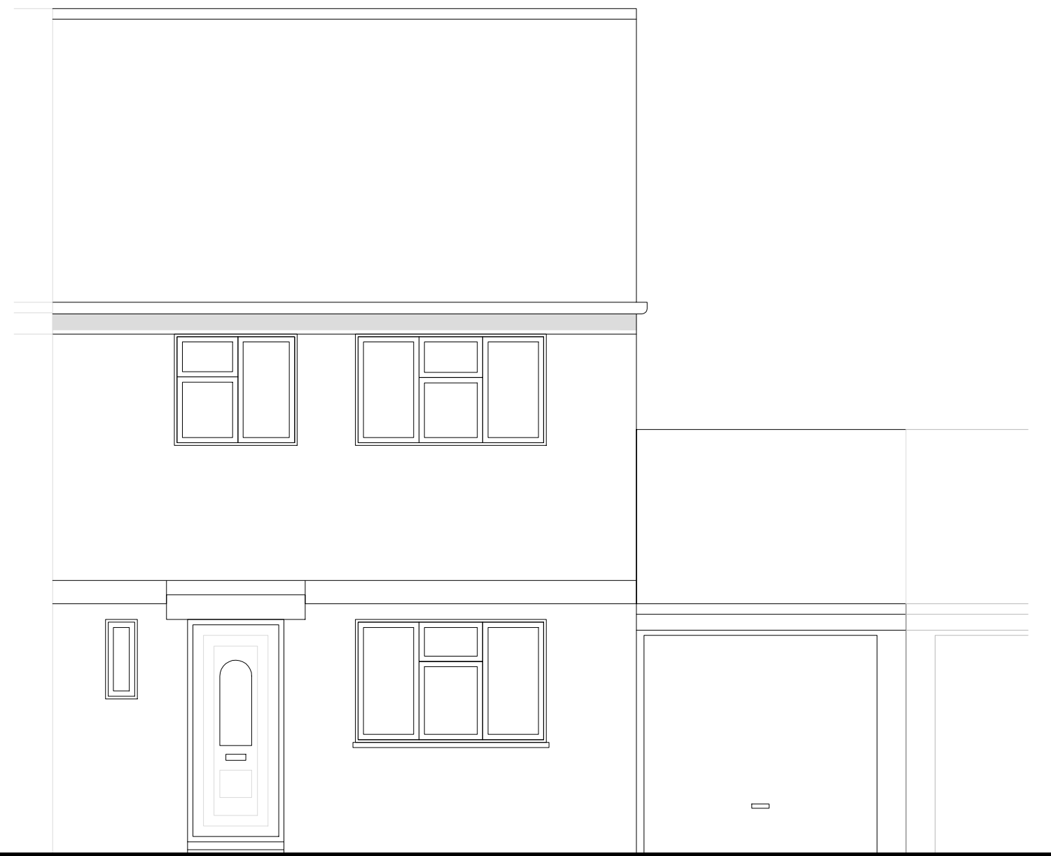
EXISTING FRONT ELEVATION Scale 1:50