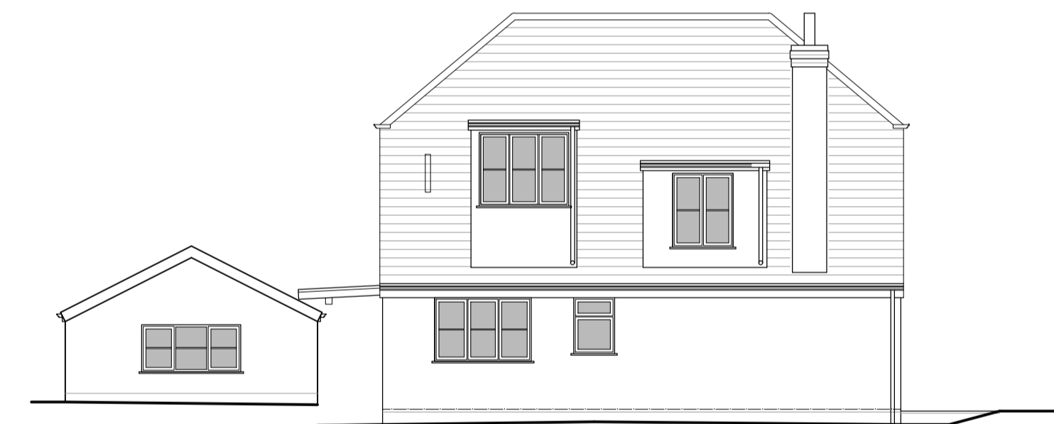
south west elevation 1:100