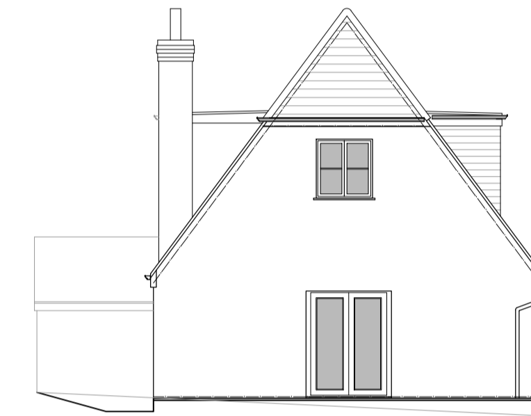
south east elevation 1:100