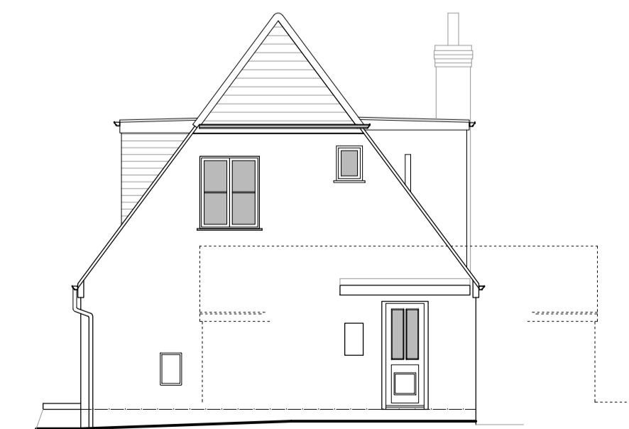
north west elevation 1:100