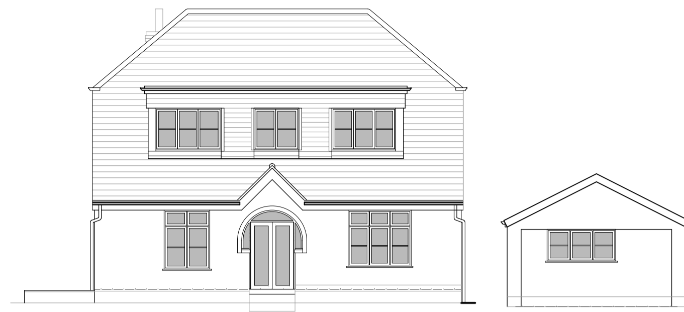
north east elevation 1:100