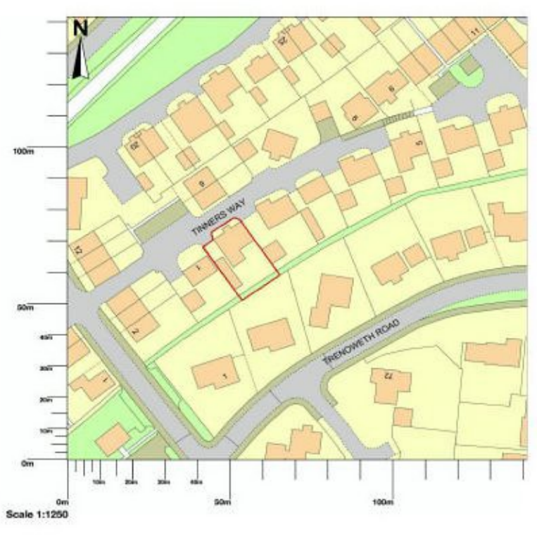
LOCATION PLAN 1:2500