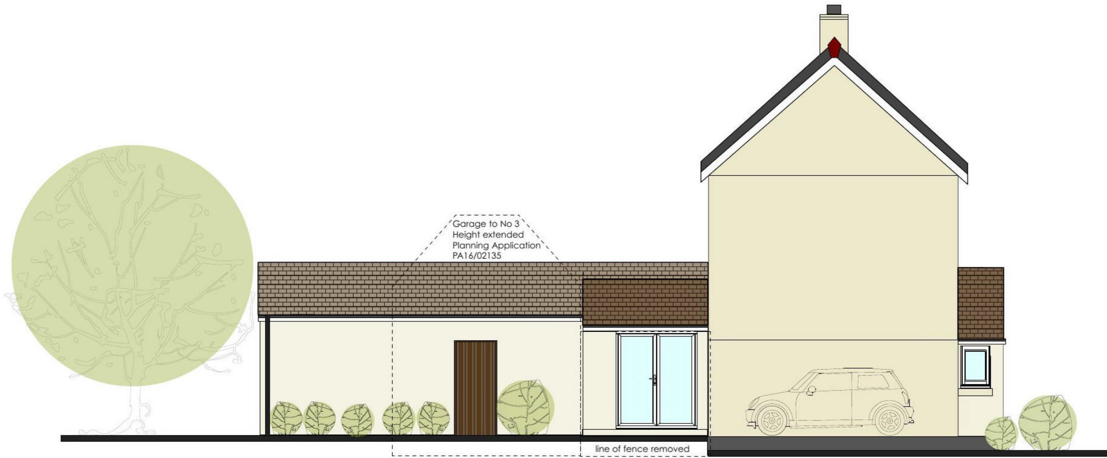
SIDE ELEVATION - WEST