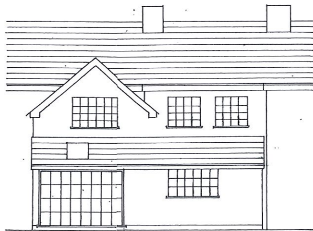
WEST ELEVATION ELEVATIONS scale 1:100 roof · natural slate