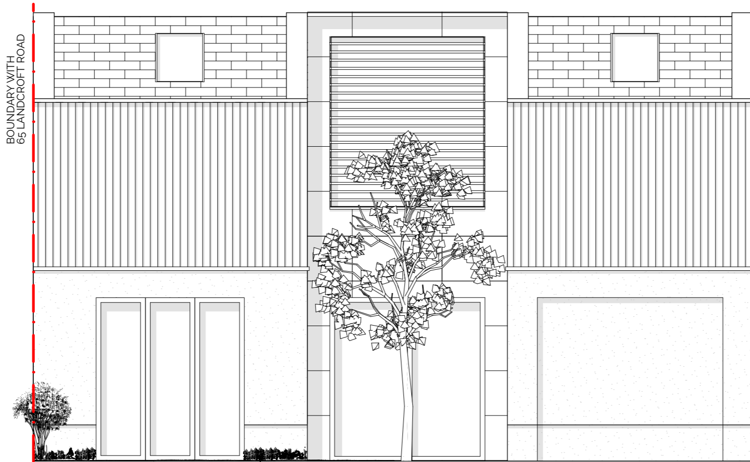
PROPOSED GARDEN SIDE ELEVATION 1:50