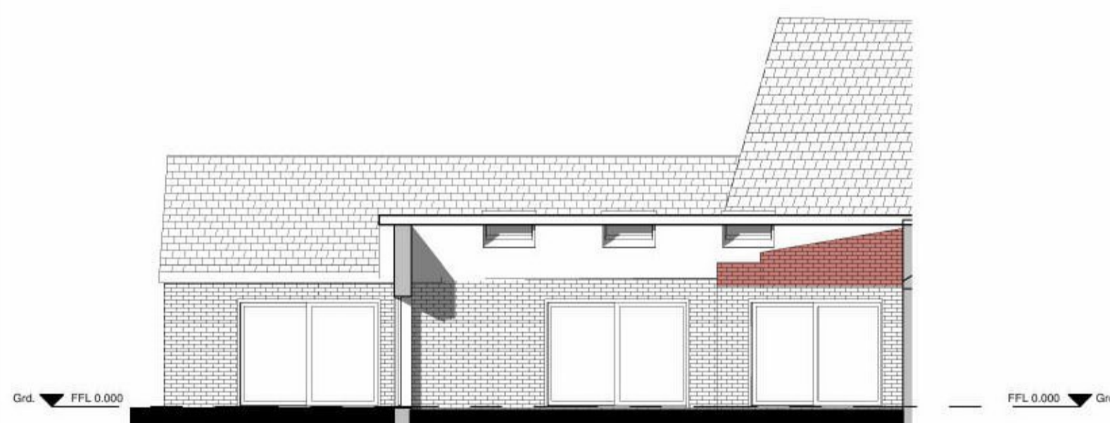
Proposed East Elevation 1 : 100