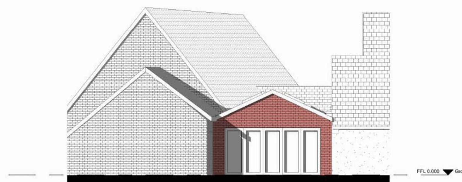
Proposed North Elevation 1 : 100