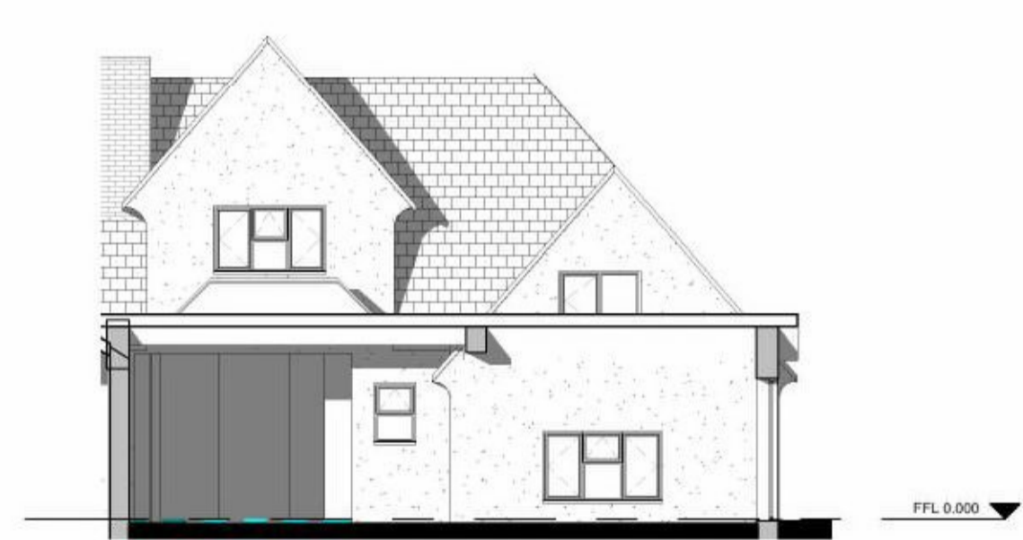
Proposed West Elevation 1 : 100