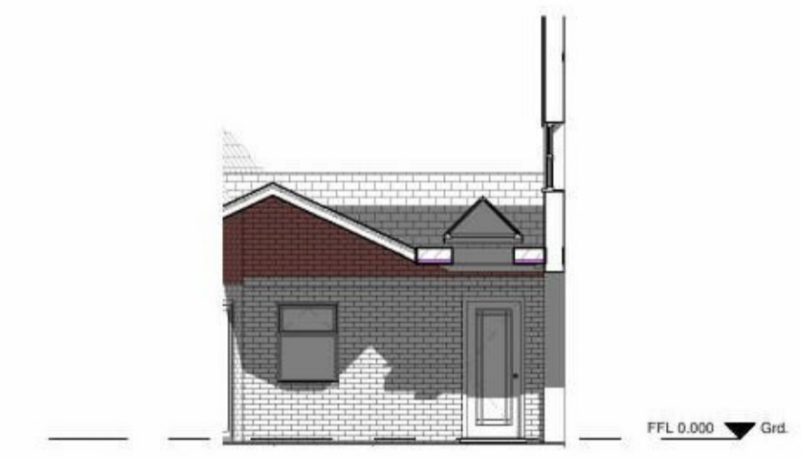
Section A 1 : 100