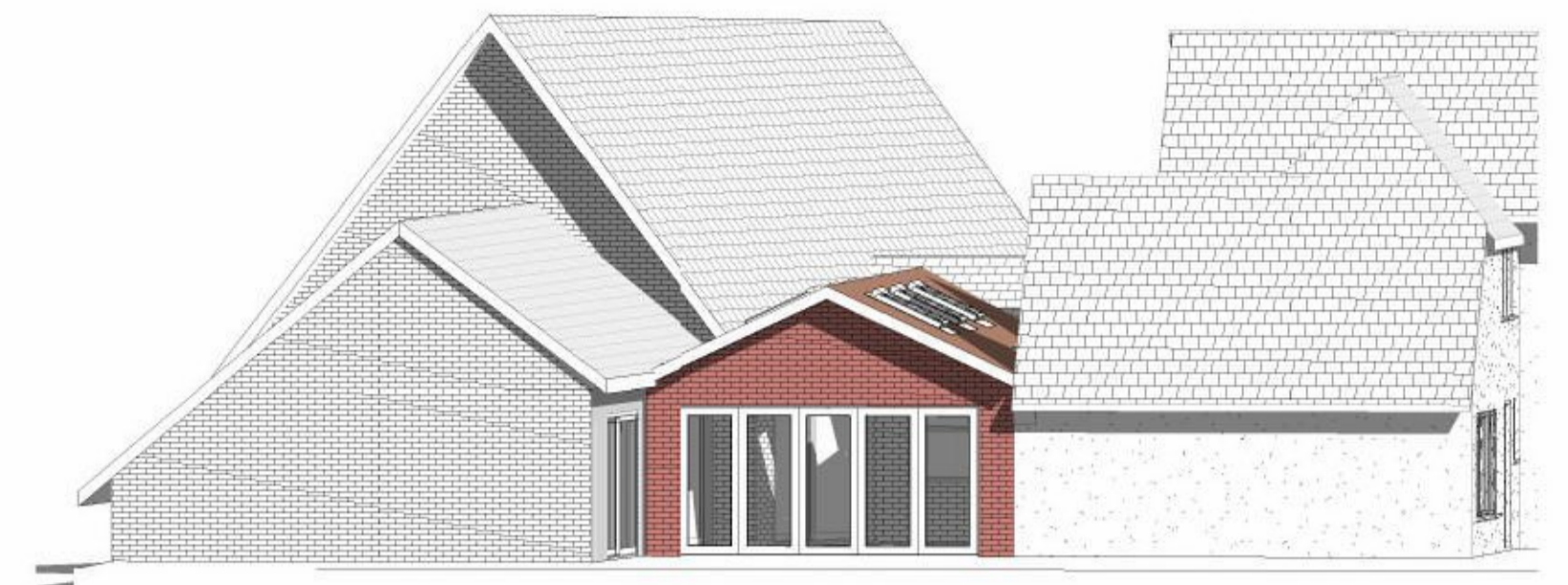
Proposed View 1