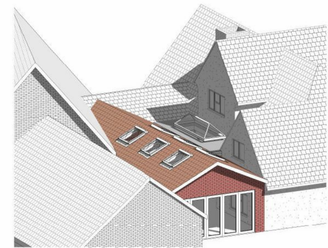
Proposed View 2