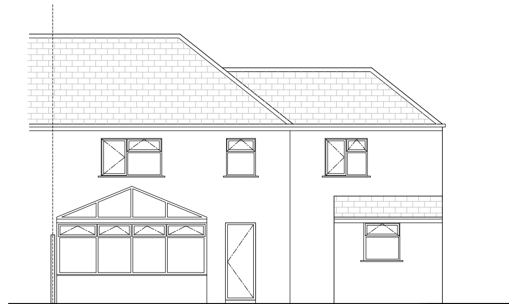
Existing GA Rear Elevation 1:100