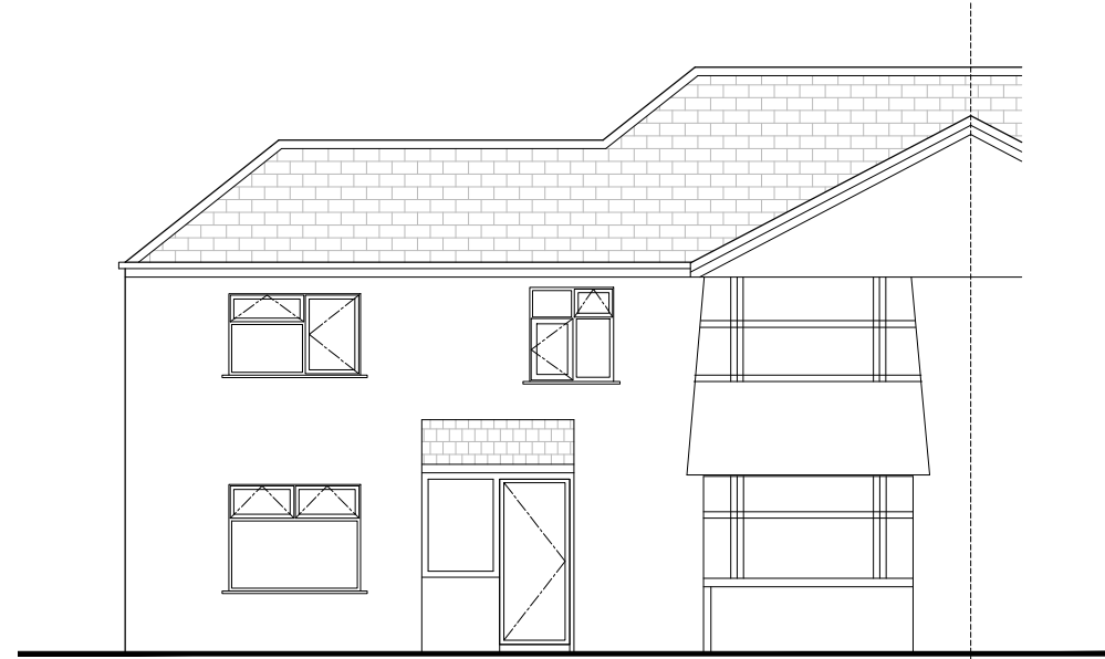
Existing GA Front Elevation 1:100