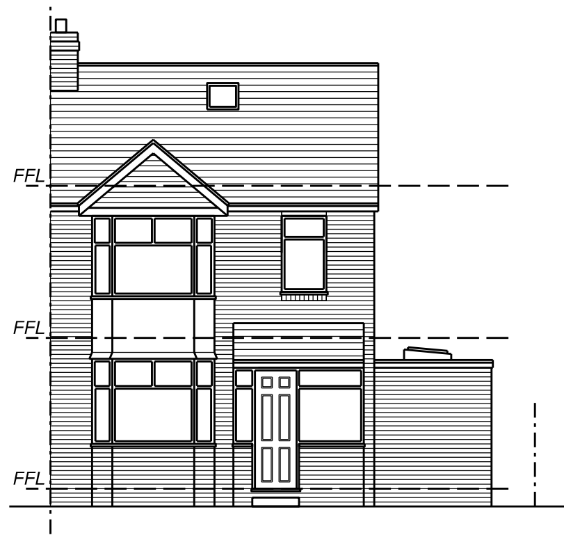
West / Beaumont Road Elevation