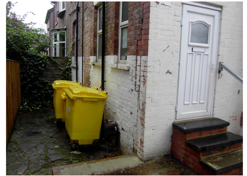
Photographs of location of extension

Ordnance Survey and the OS Symbol are registered trademarks of Ordnance Survey, the national mapping agency of Great Britain. Buy A Plan logo, pdf design and the buyaplan.co.uk website are Copyright © Pass Inc Ltd 2015