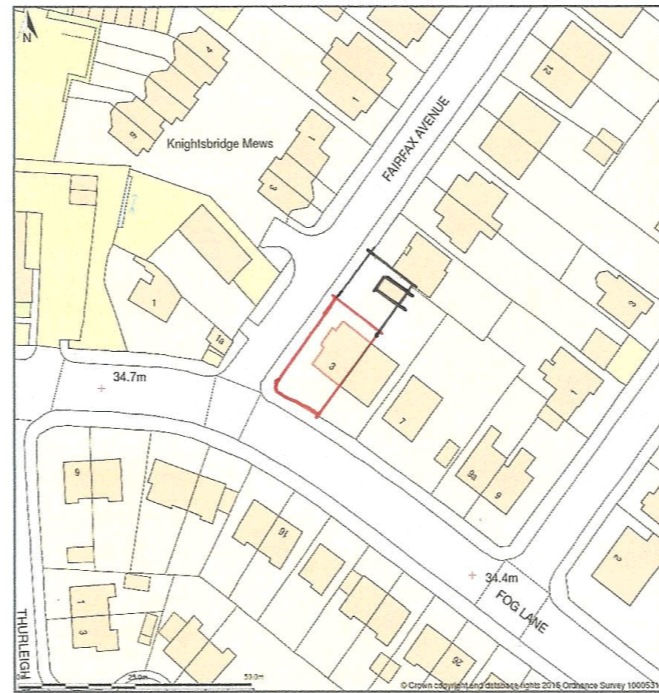
Location Plan 1.1250

Site Plan shows area bounded by: 384721.2893,391699.2893 384862.7107,391840.7107 (at a scale of 1:1250) The representation of a road, track or path is no evidence of a right of way. The representation of features as lines is no evidence of a property boundary.