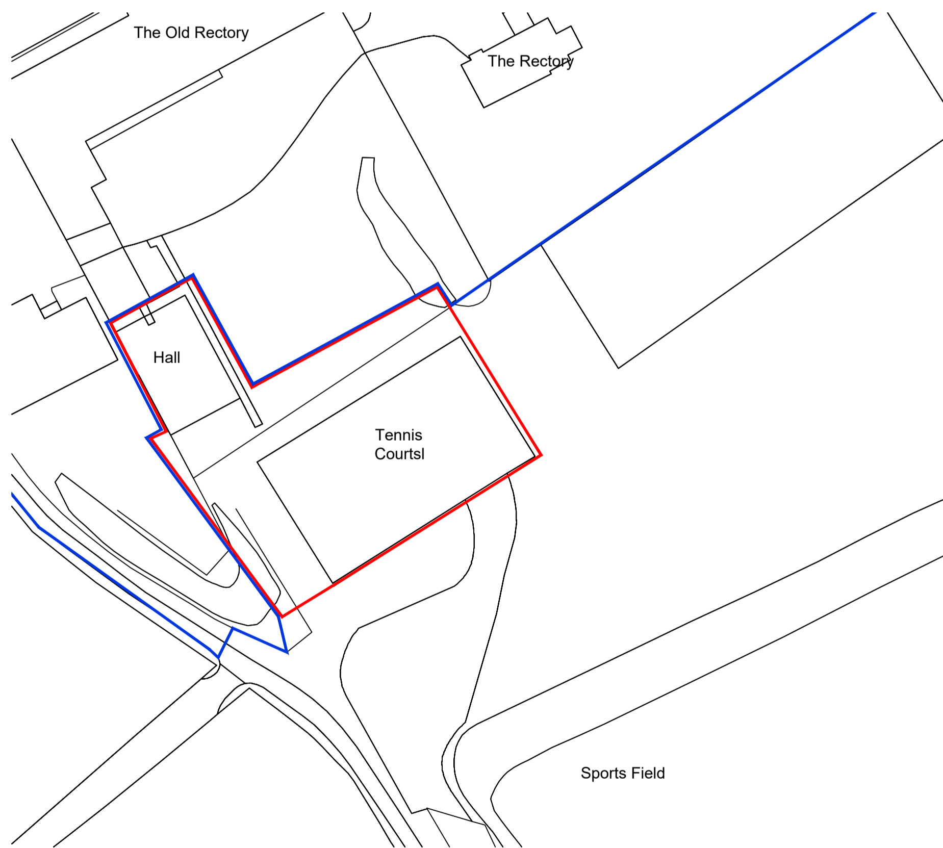
Block plan Scale 1:500 @ A1