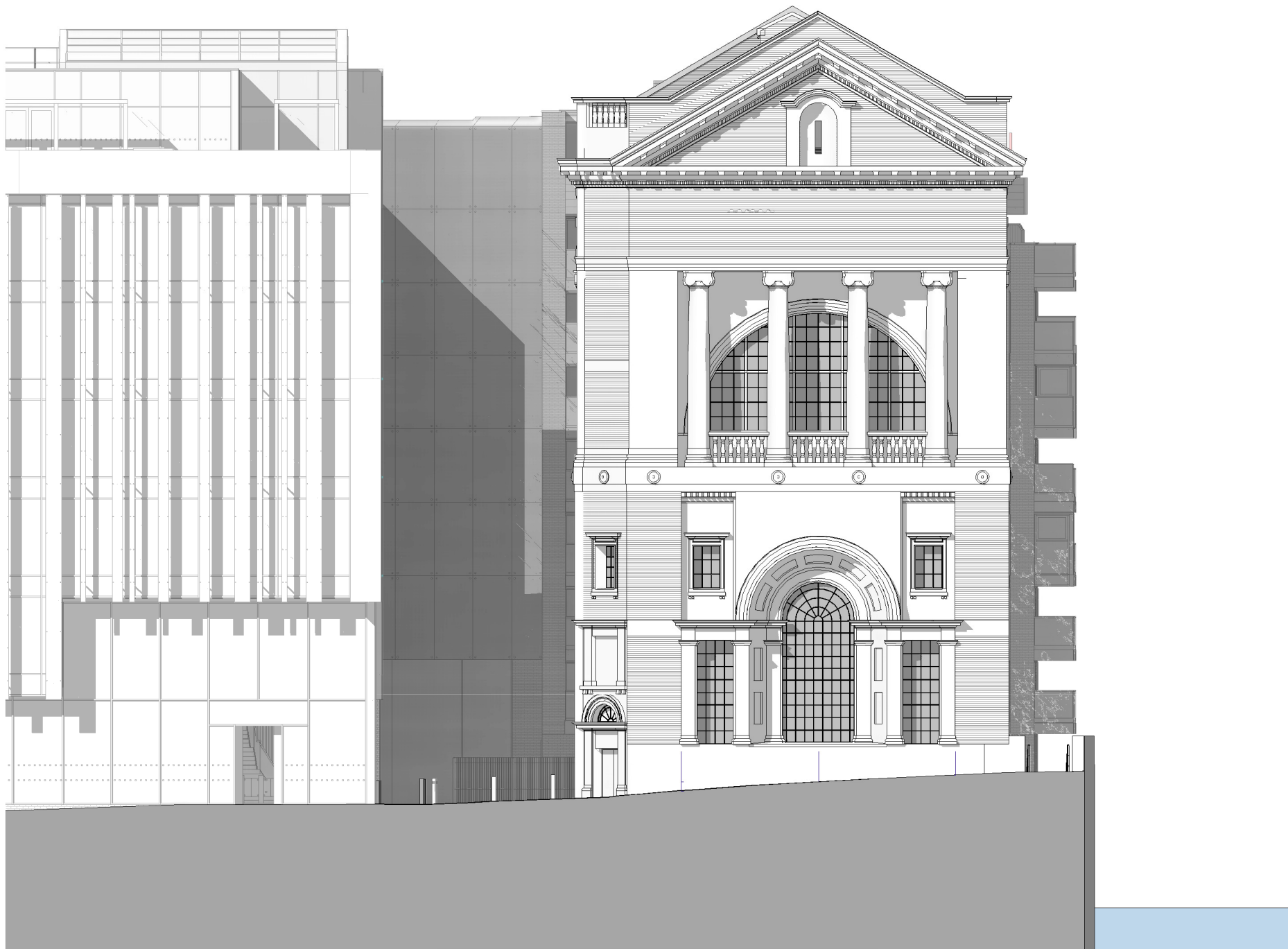
South-East Elevation (Existing) 1 : 200