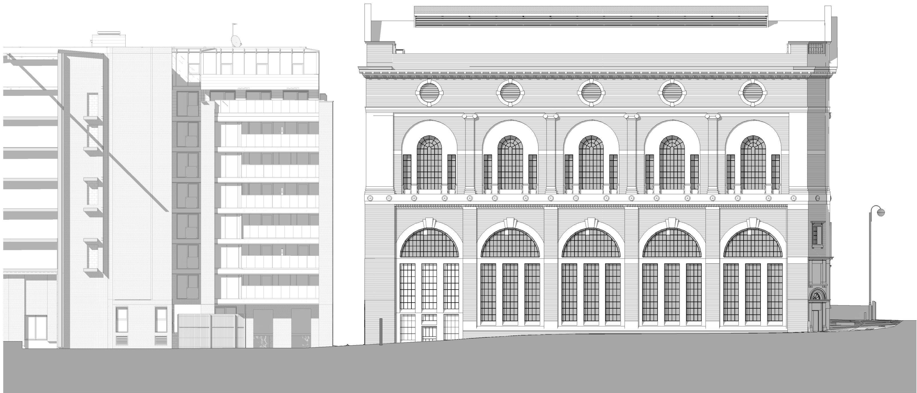
South-West Elevation (Existing) 1 : 200