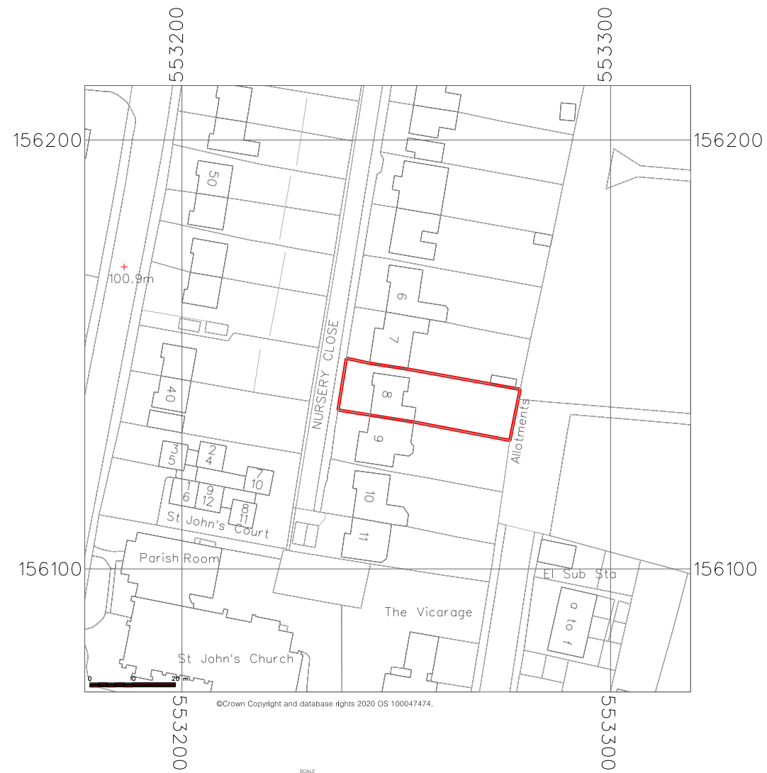
① LOCATION PLAN 1250