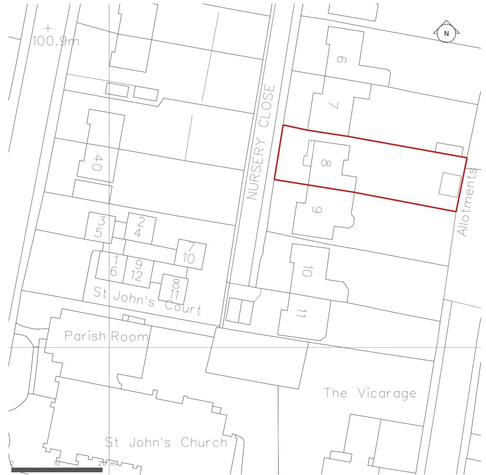
② BLOCK PLAN 500