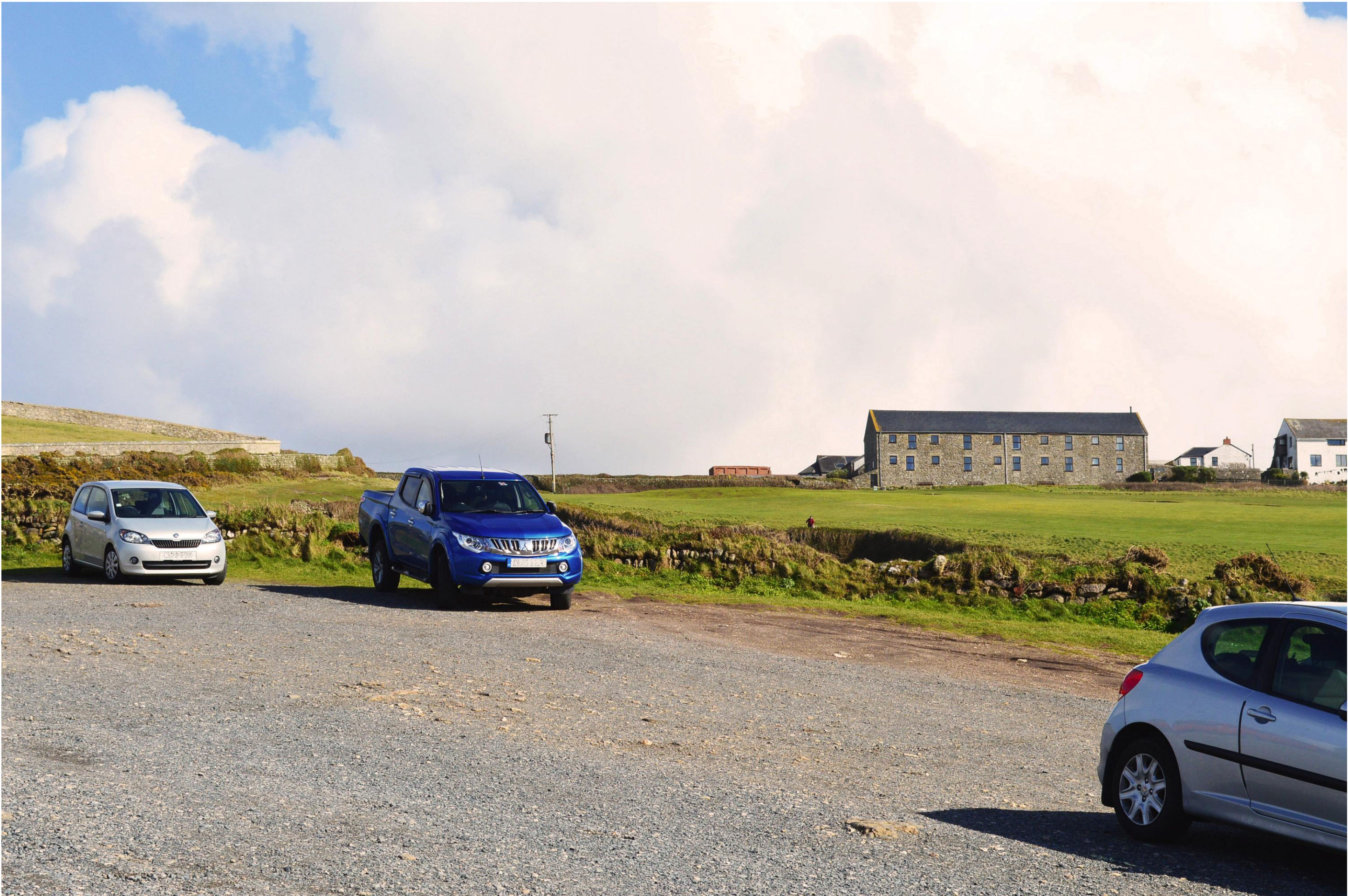
EXISTING VIEW - SW 35336 31798