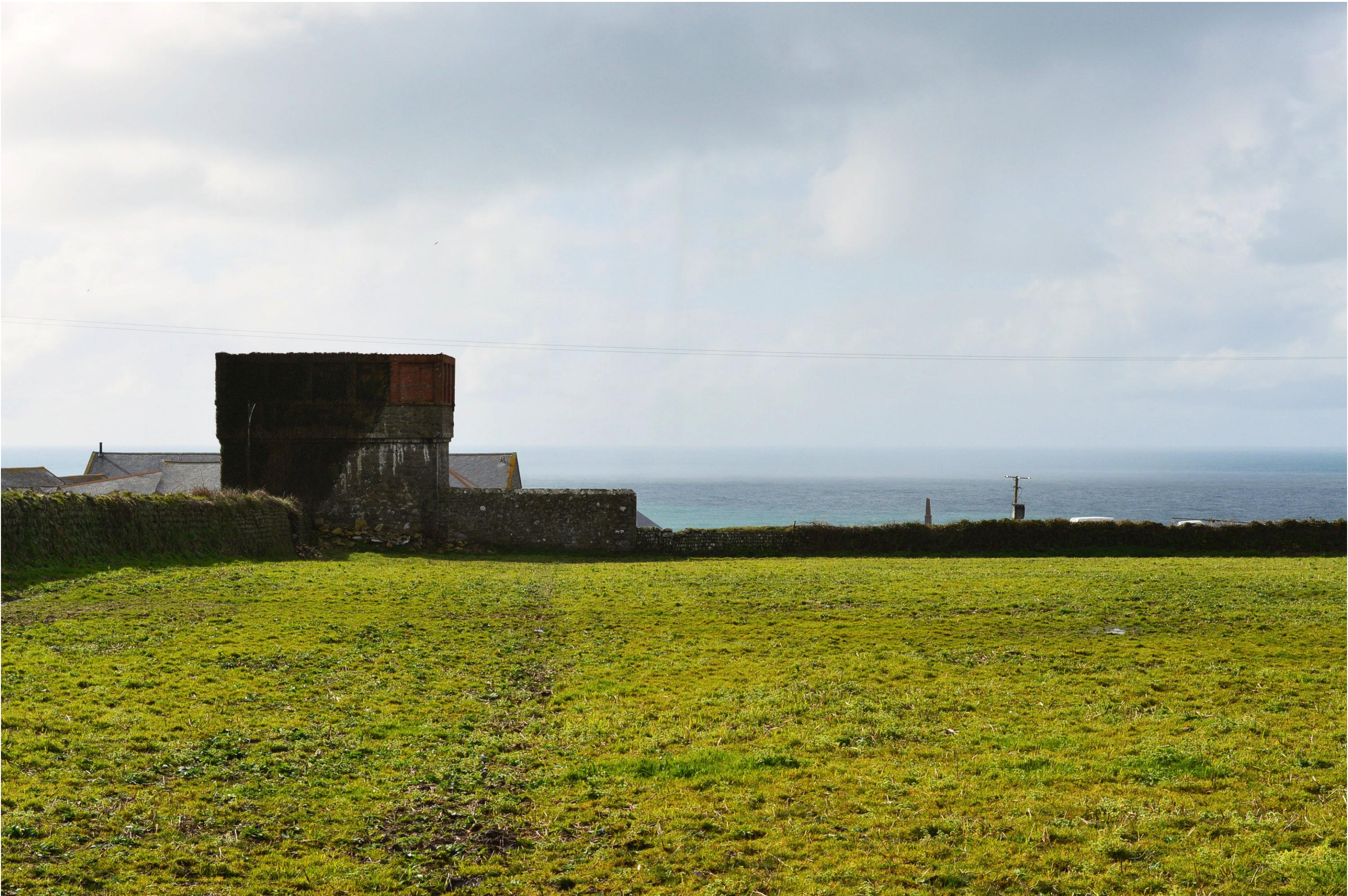
PROPOSED VIEW - SW 35859 31712