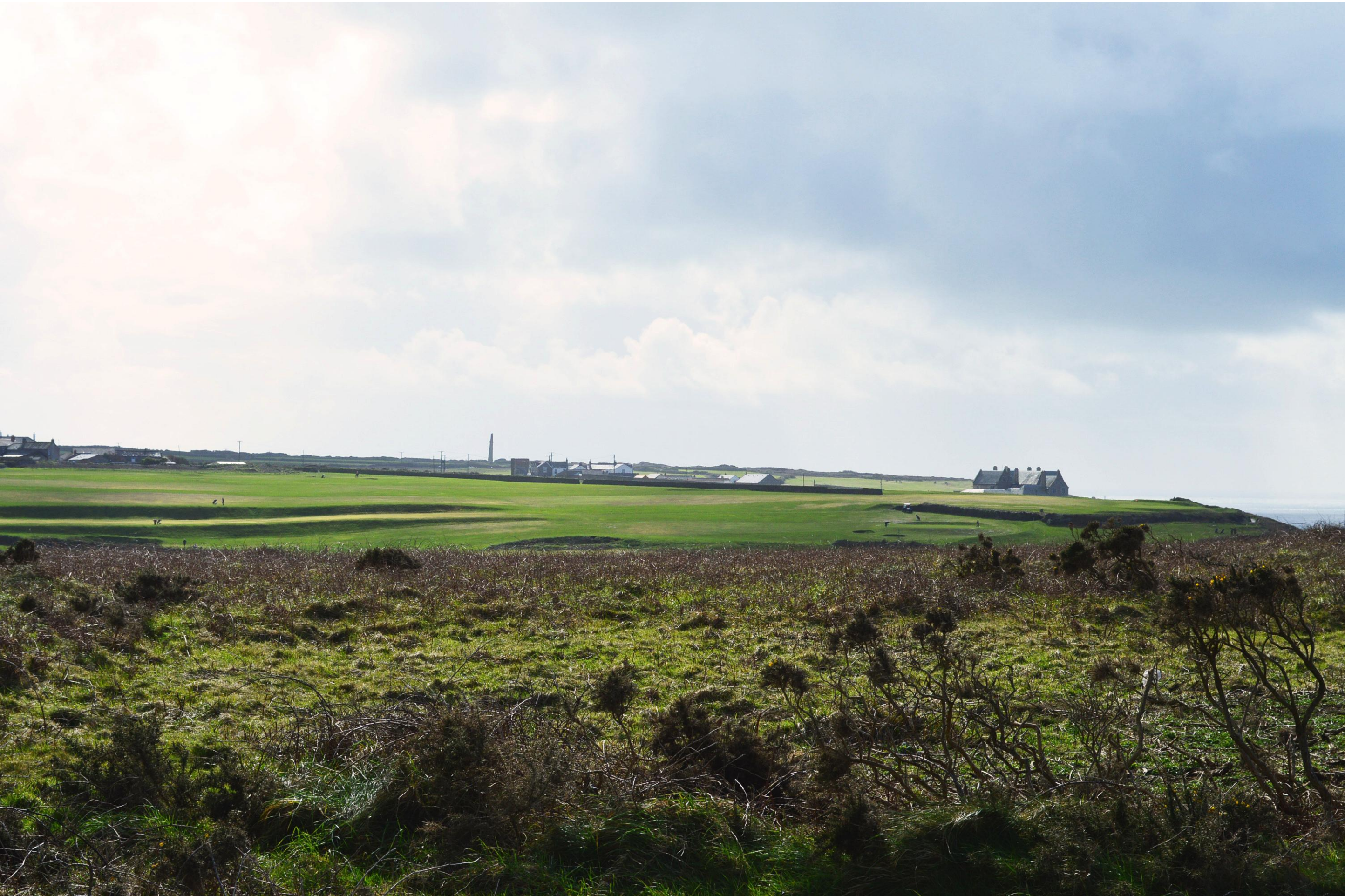
PROPOSED VIEW - SW 36024 32656