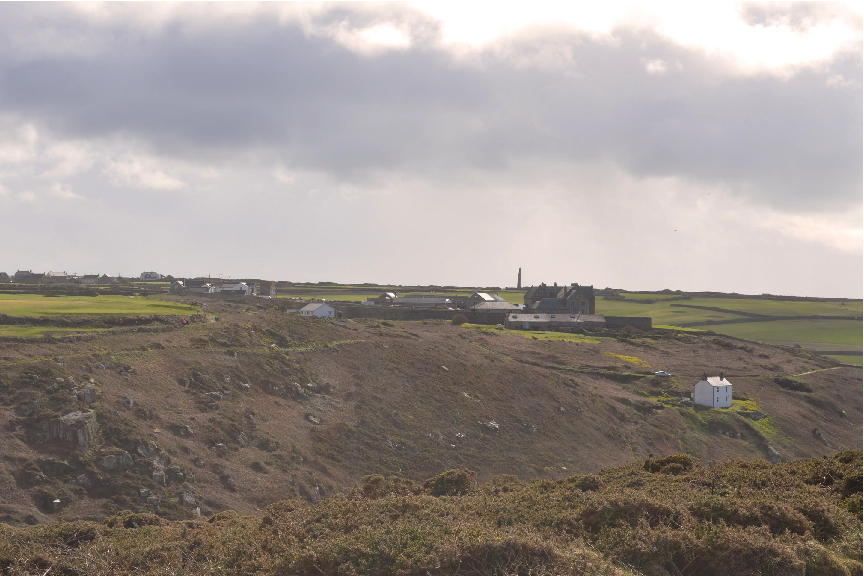
EXISTING VIEW - 35622 32491