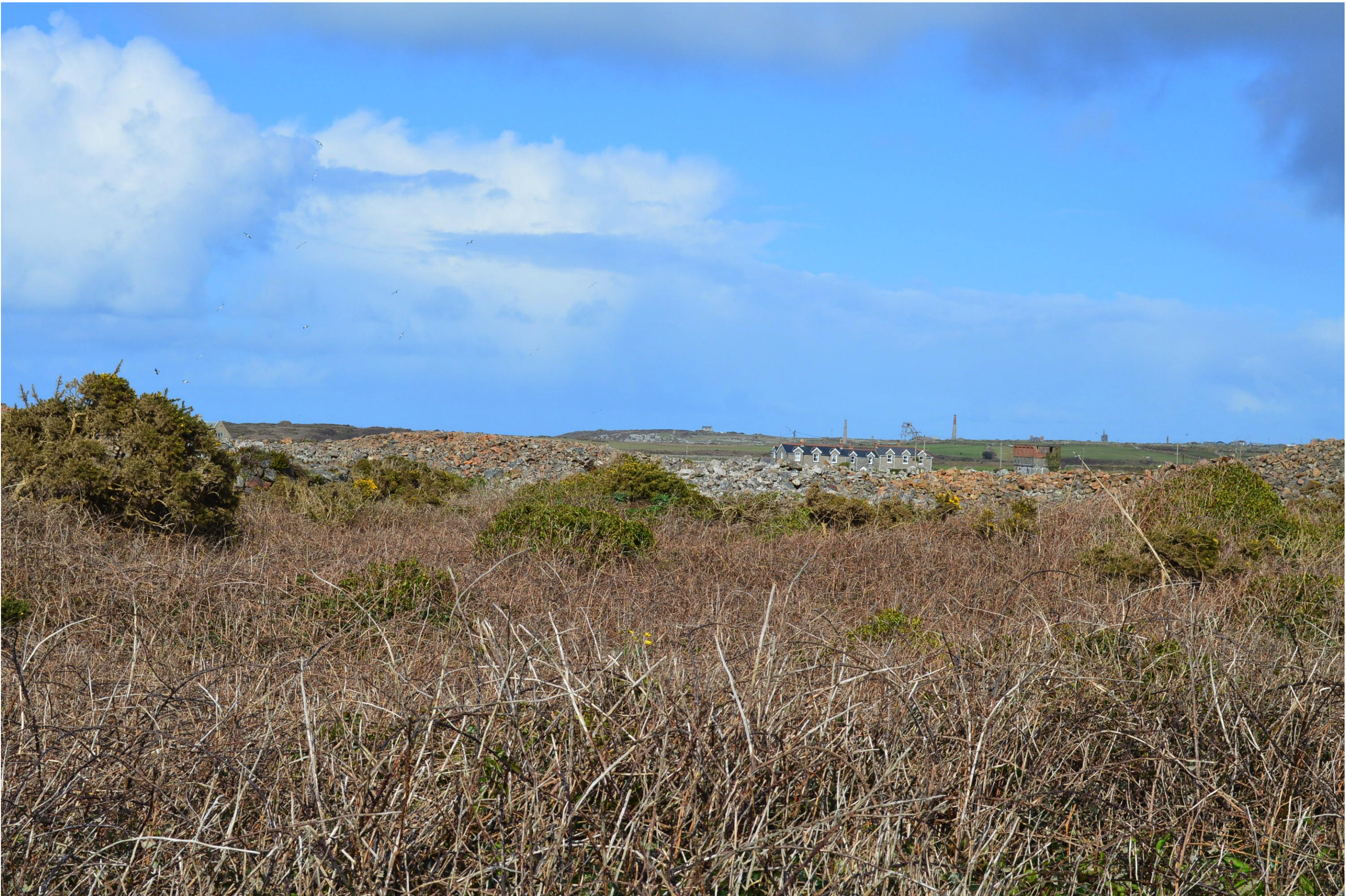
EXISTING VIEW - SW 35531 31282