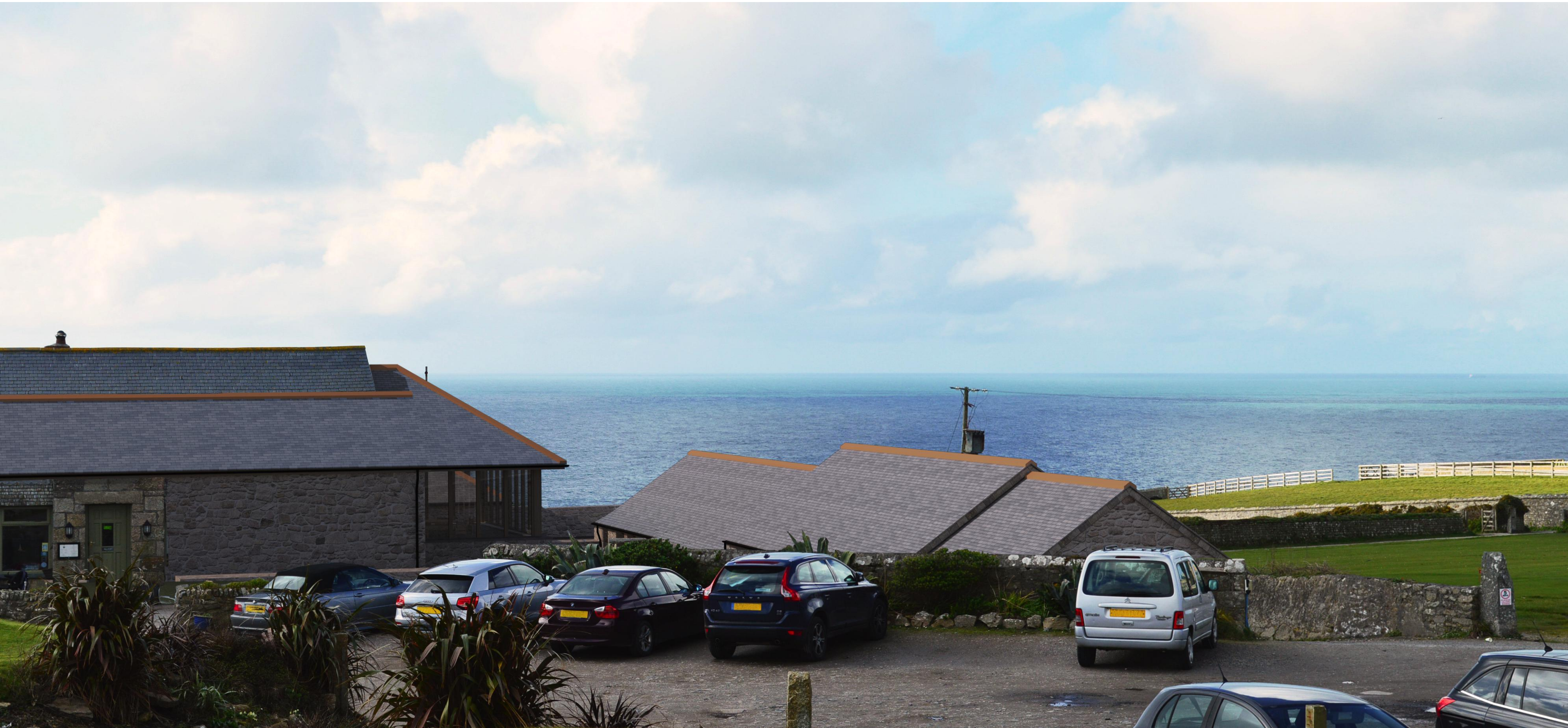
PROPOSED VIEW - 1ST TEE