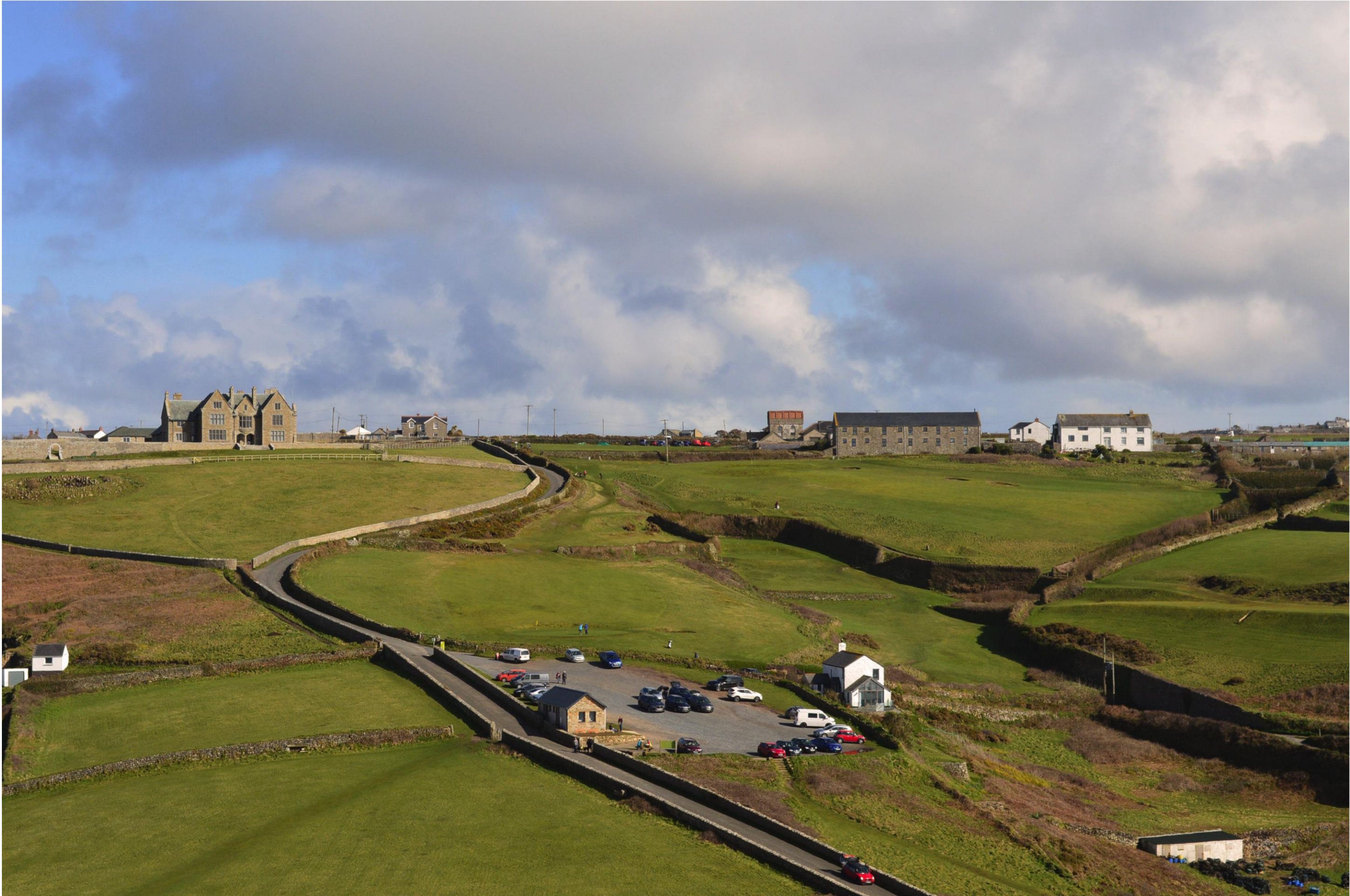
PROPOSED VIEW - SW 35036 31827