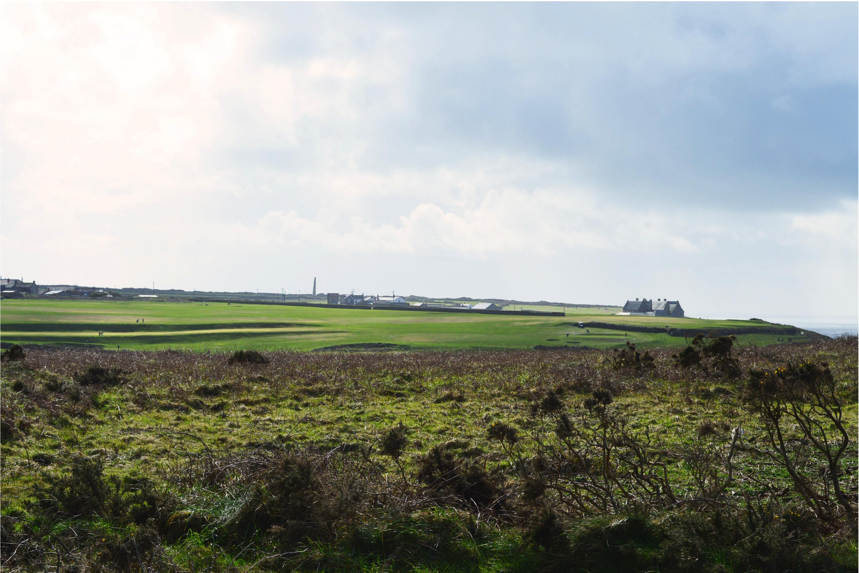
EXISTING VIEW - SW 36024 32656