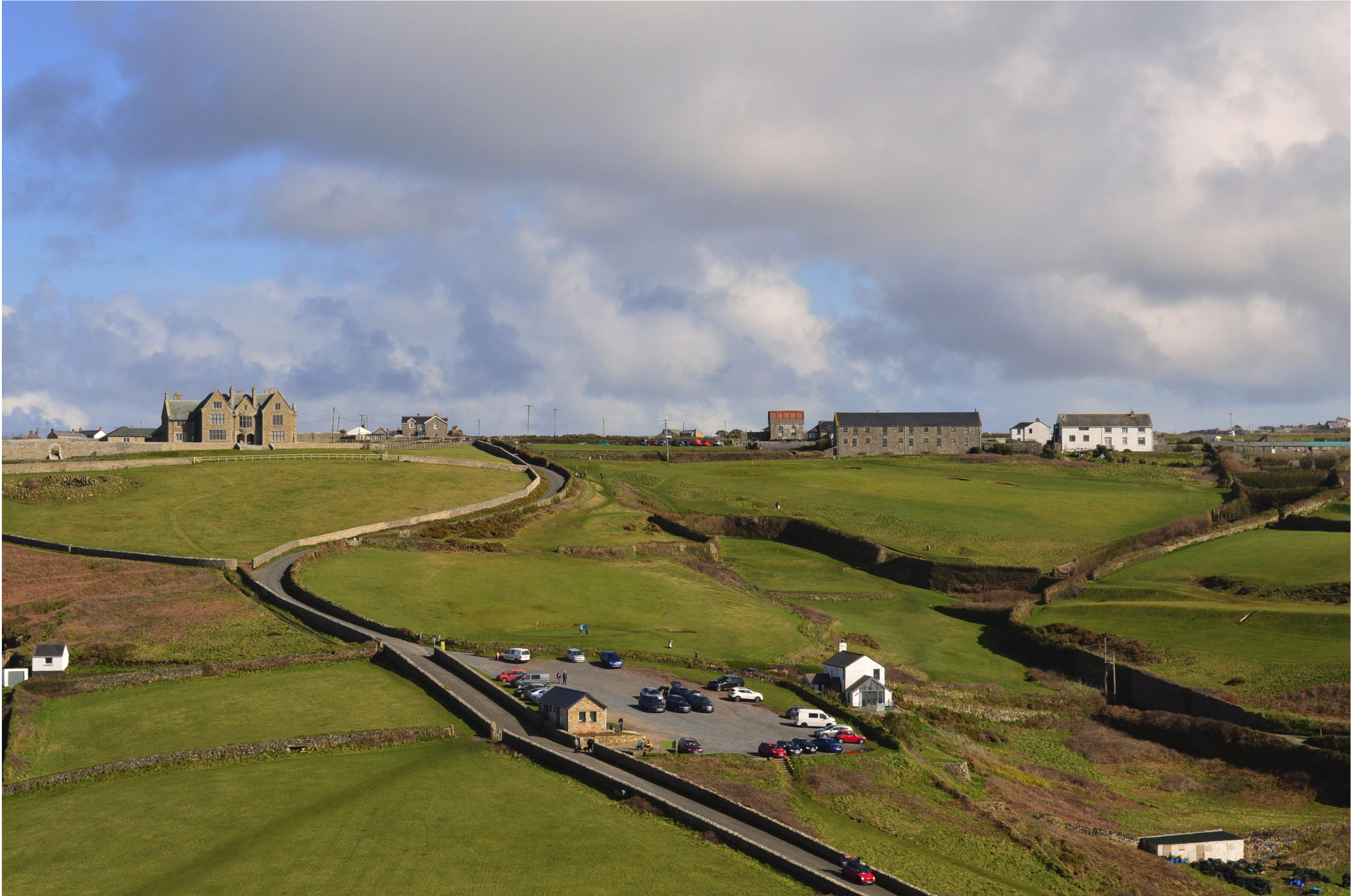
EXISTING VIEW - SW 35036 31827