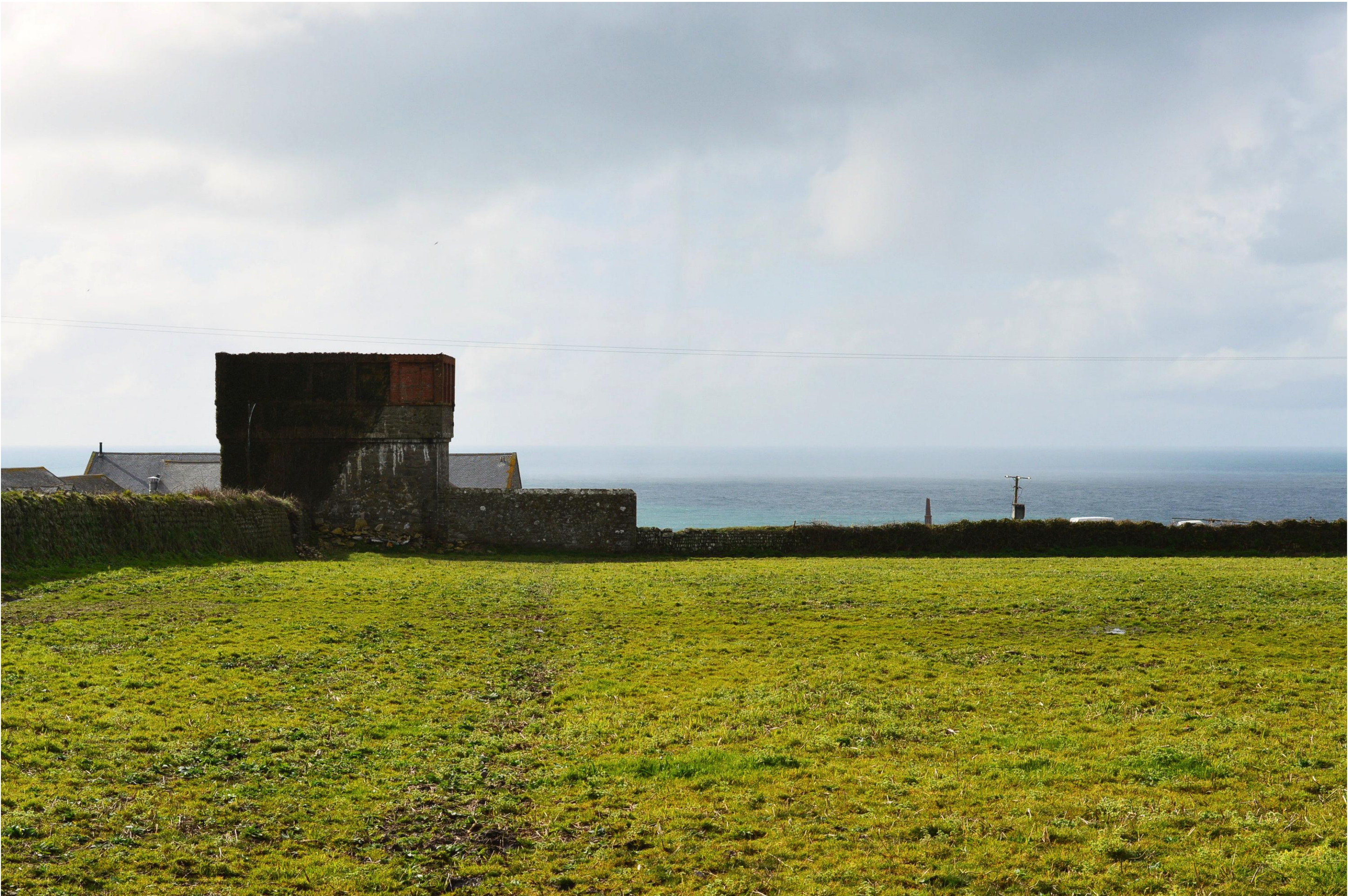
EXISTING VIEW - SW 35859 31712