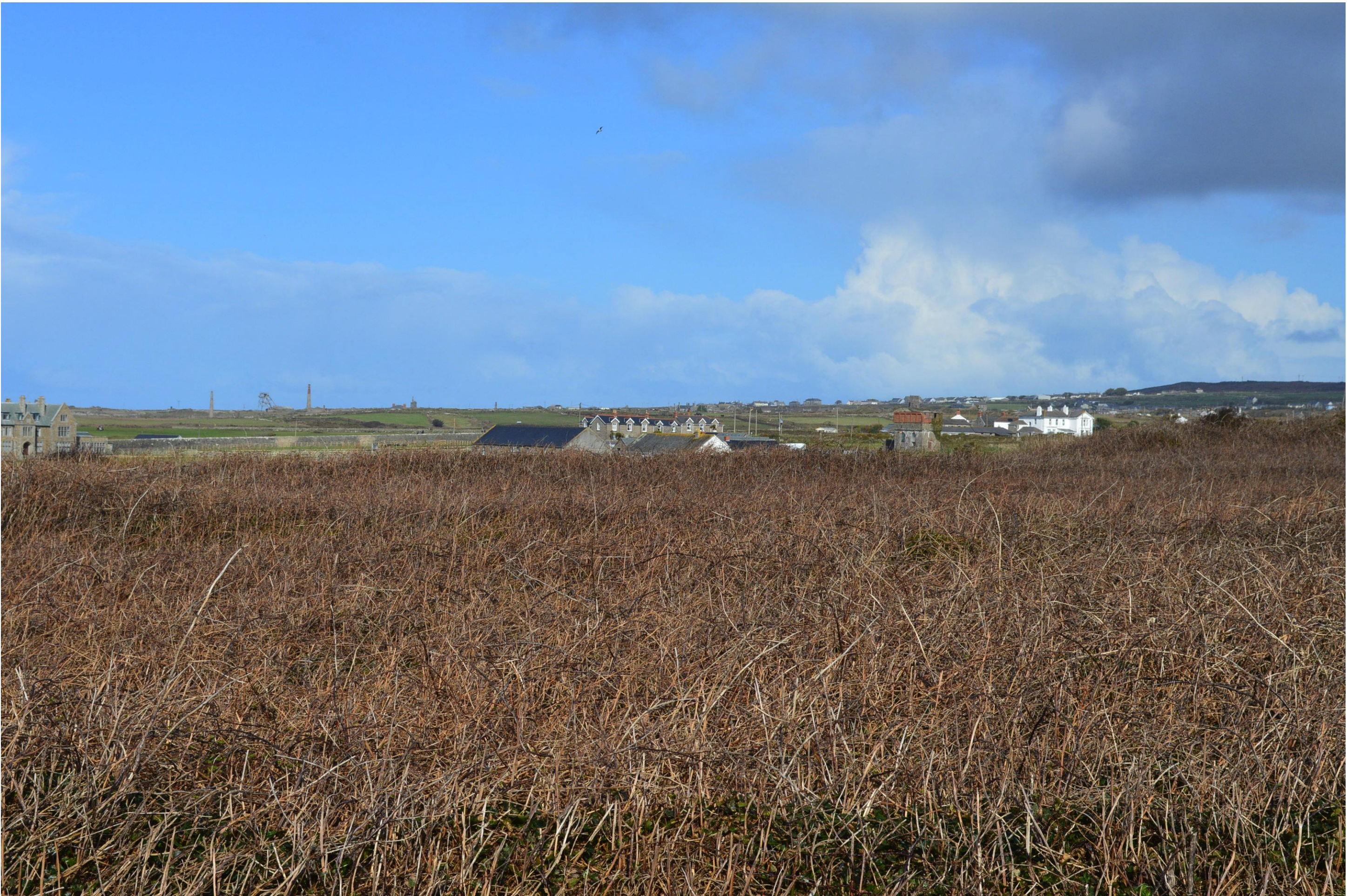
EXISTING VIEW - 35381 31302