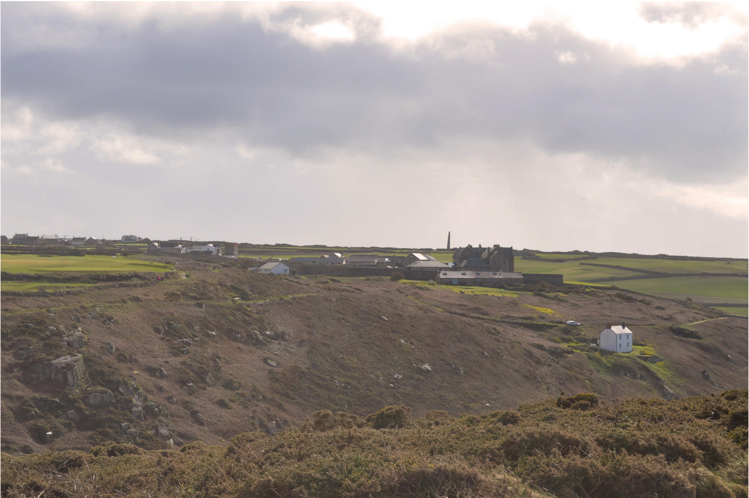
PROPOSED VIEW - 35622 32491