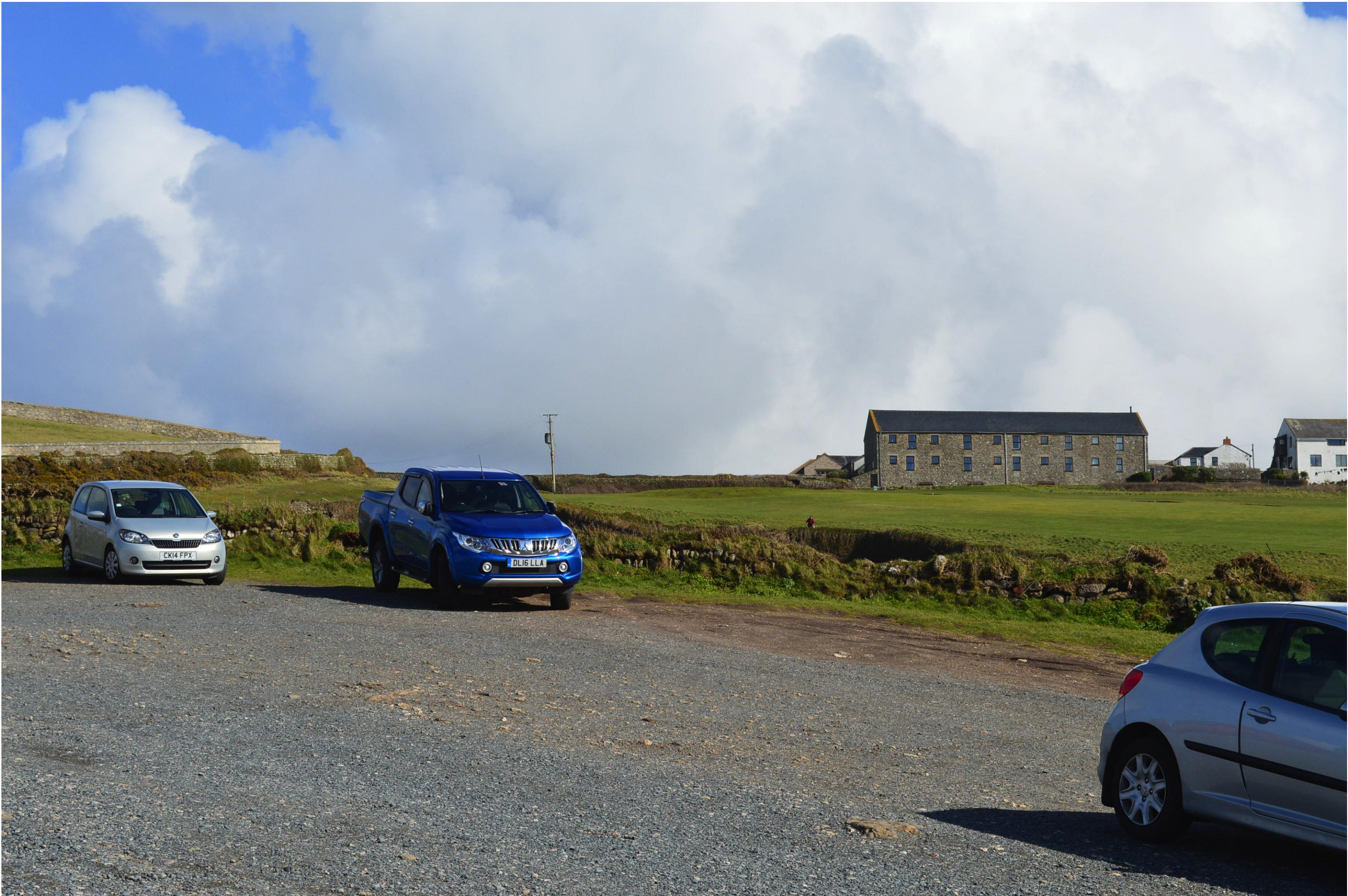
PROPOSED VIEW - SW 35336 31798