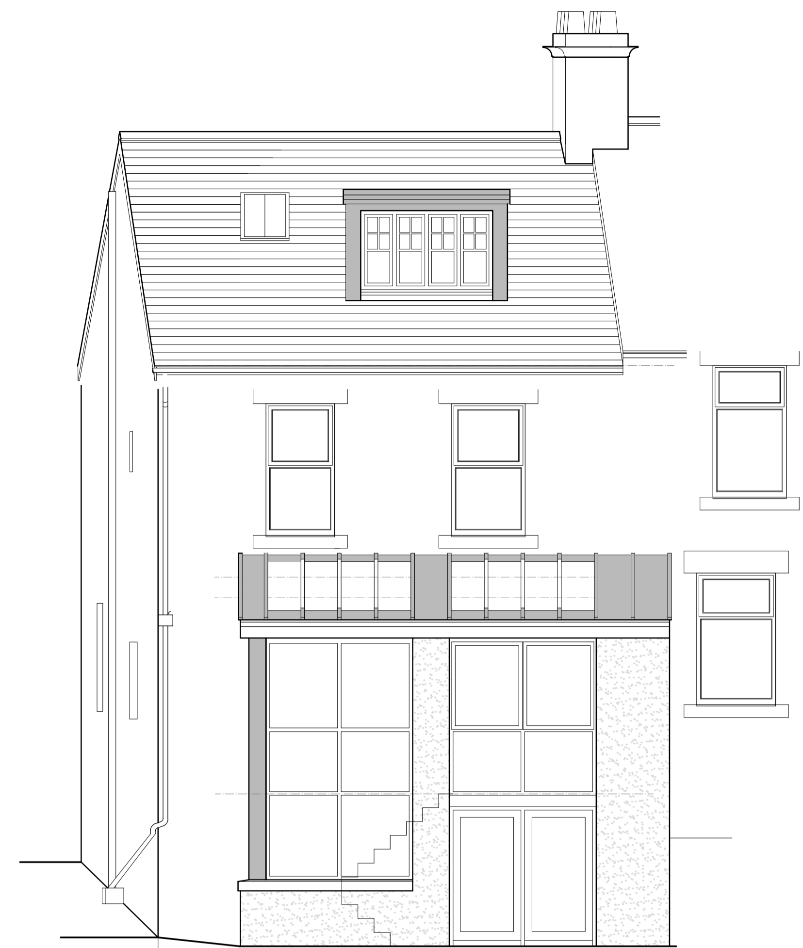
NORTH ELEVATION 1:50

Discrepancies, ambiguities and/or omissions between this drawing and information given elsewhere must be reported to the architect before proceeding. This drawing is copyright. Dimensions must be checked on site. Do not scale off dimensions from this drawing.