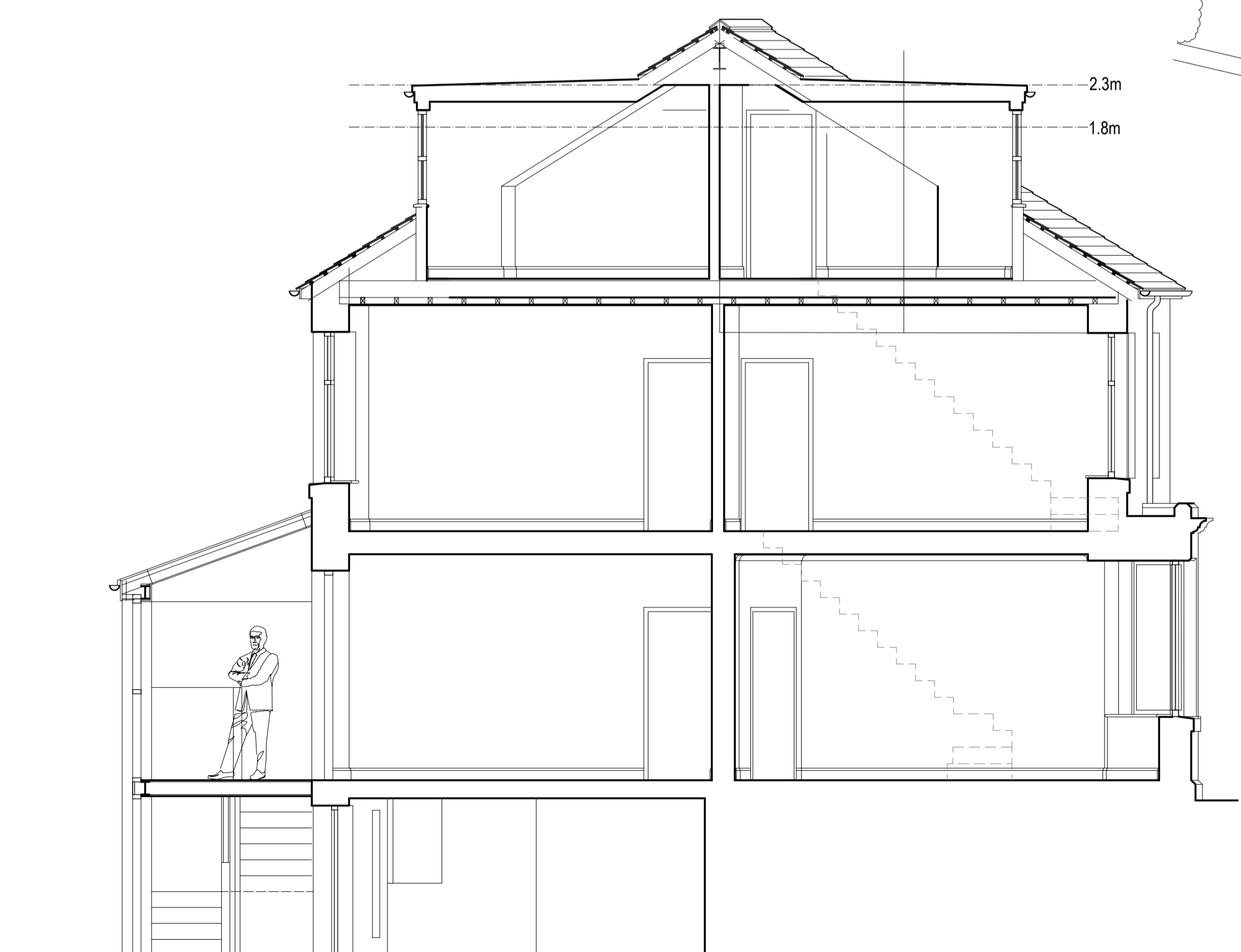
SECTION AA 1:50