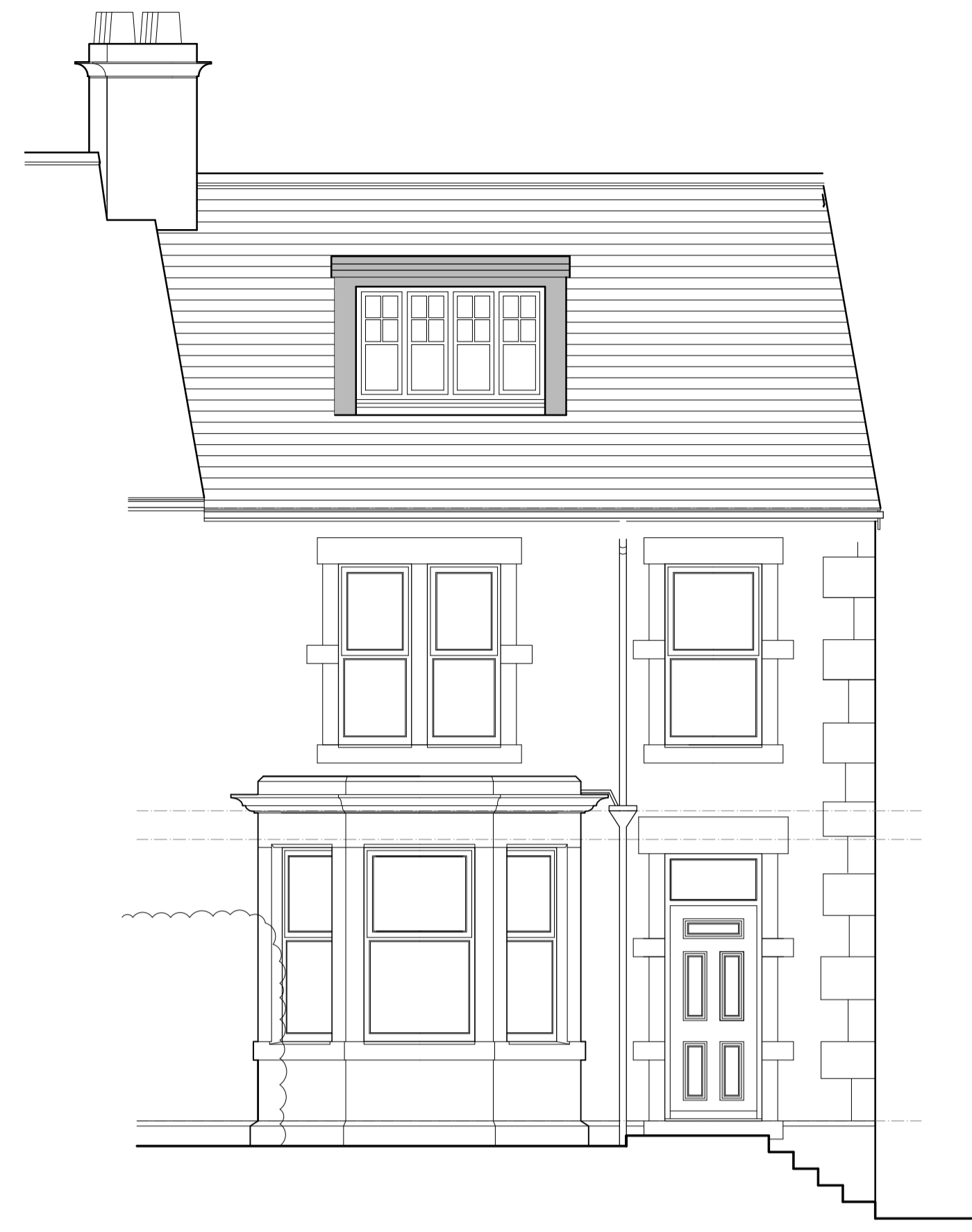
SOUTH ELEVATION 1:50