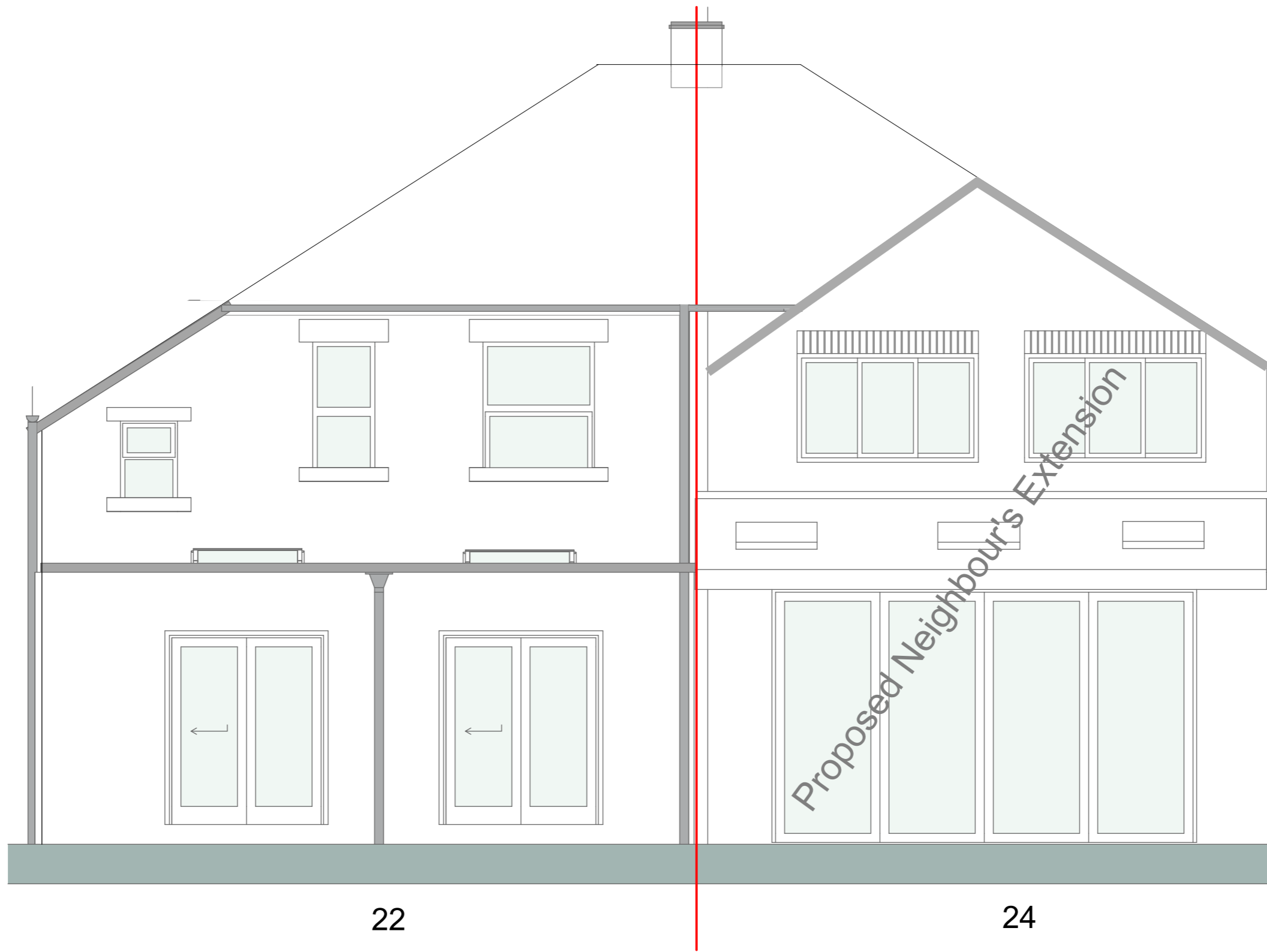
Rear Elevation with neighbour's proposal