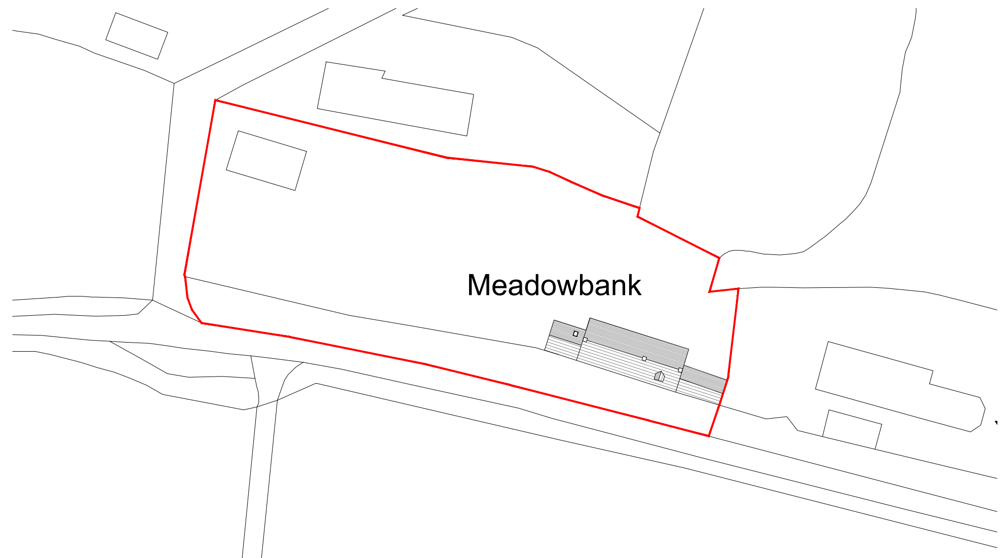
BLOCK PLAN 1:500 0 4 8 12 16 20m