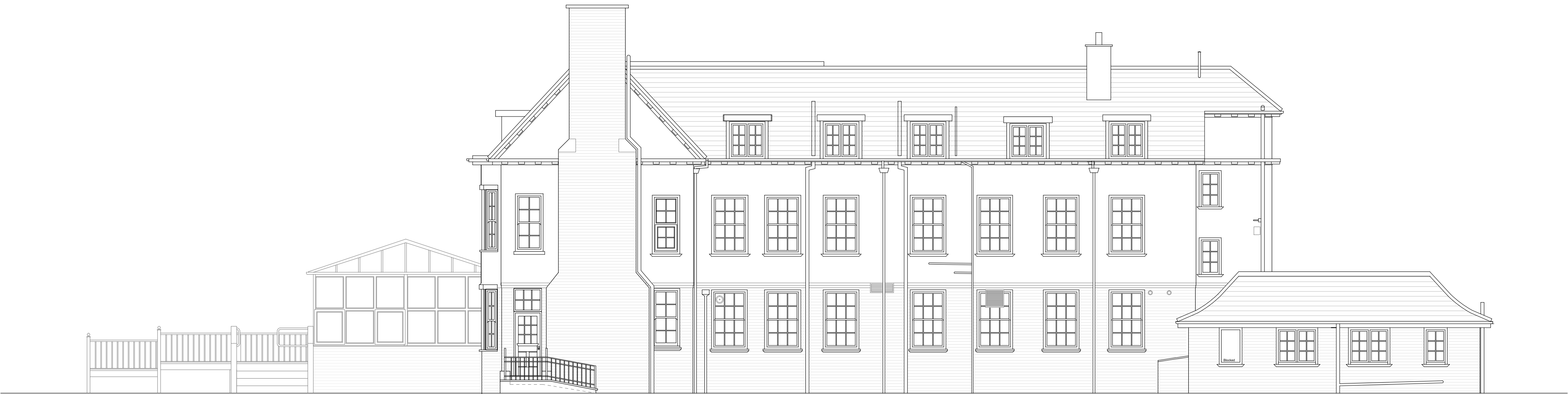
SOUTH ELEVATION @ 1:100