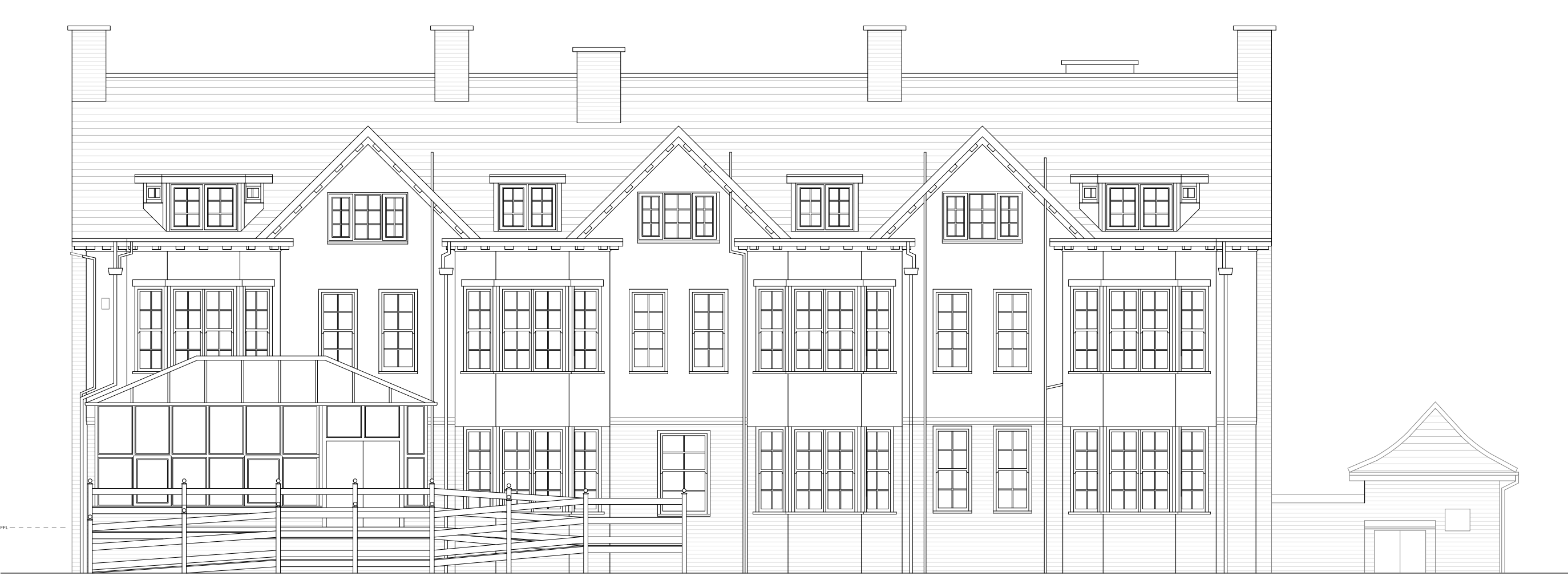
REAR ELEVATION @ 1:100