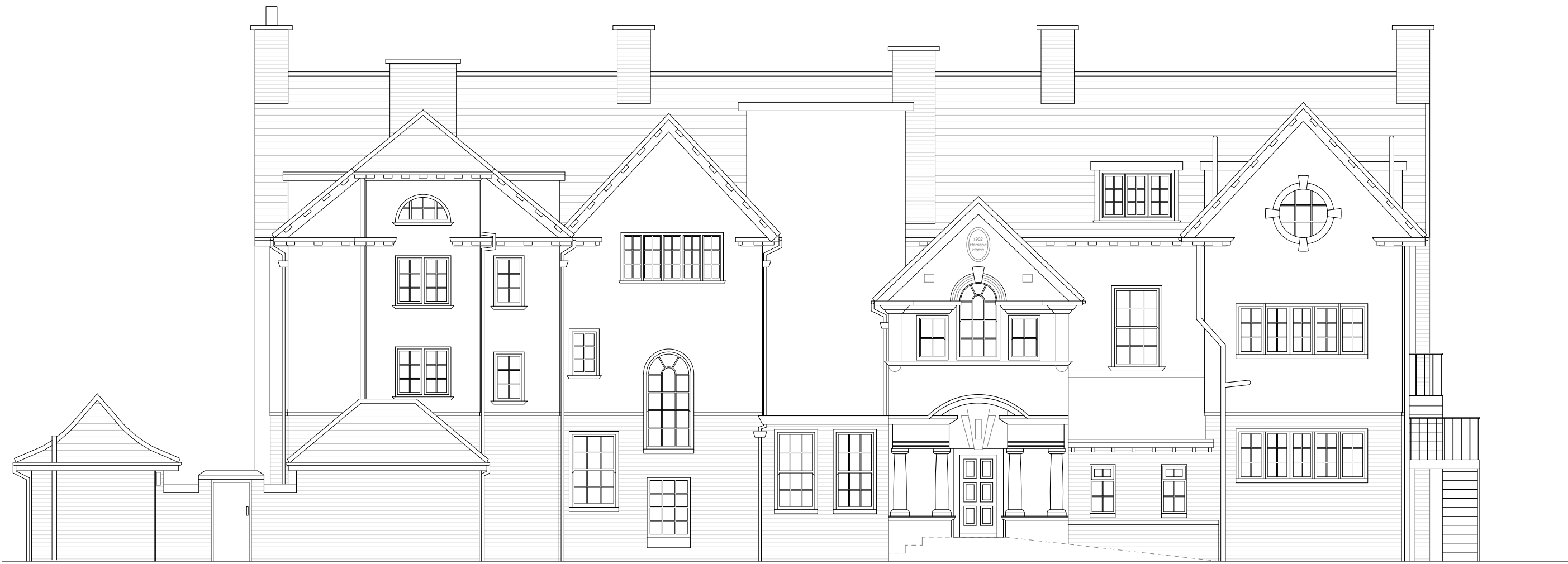
FRONT ELEVATION @ 1:100