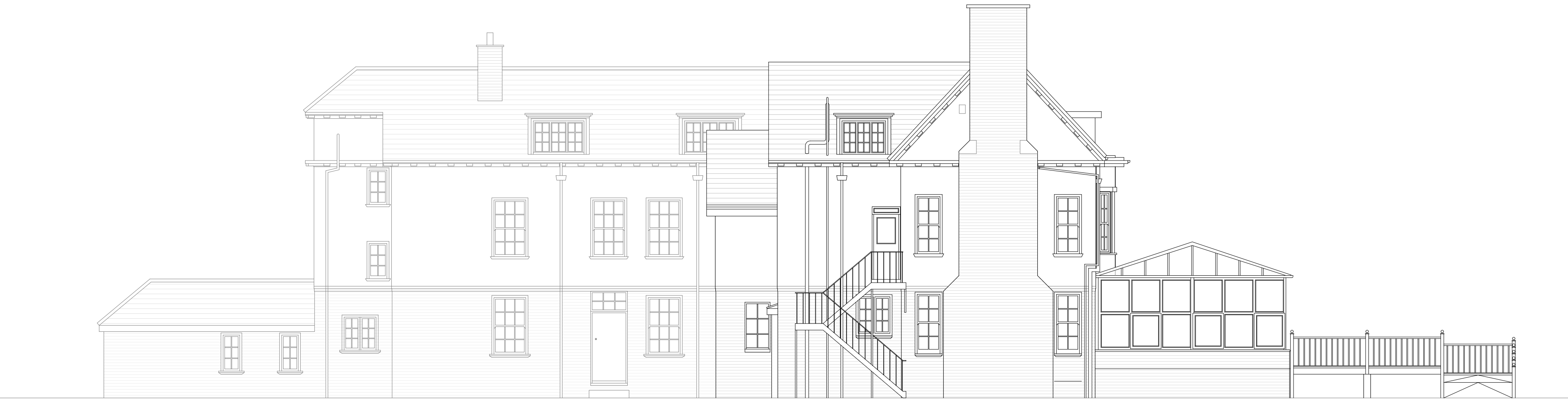
NORTH ELEVATION @ 1:100