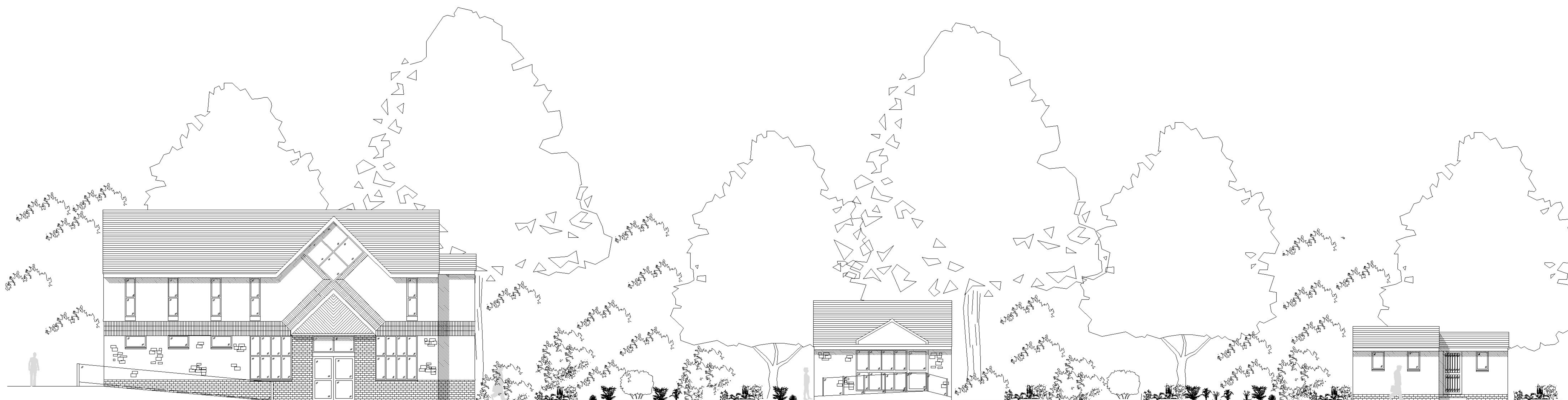
Street Elevation of Site and adjacent Buildings 1:100