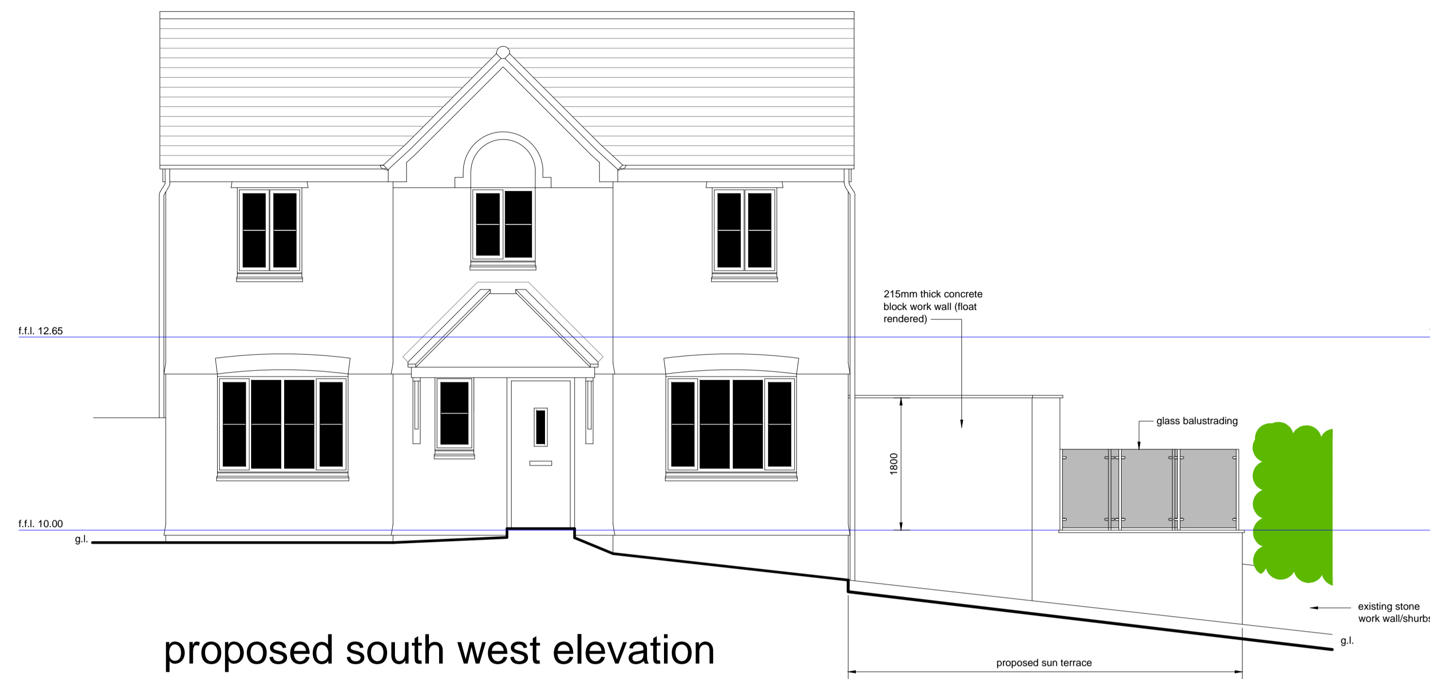
proposed south west elevation

External walls: Concrete block work float rendered and decorated with a light grey masonry paint. Wall topped with concrete coping stones. Sun terrace floor: Concrete or slate slabs on a suspended concrete beam and block floor structure. External french and bi folding doors: White uPVC. Window: White uPVC. Sun terrace balustrading/juliet balcony: Glass/stainless steel.