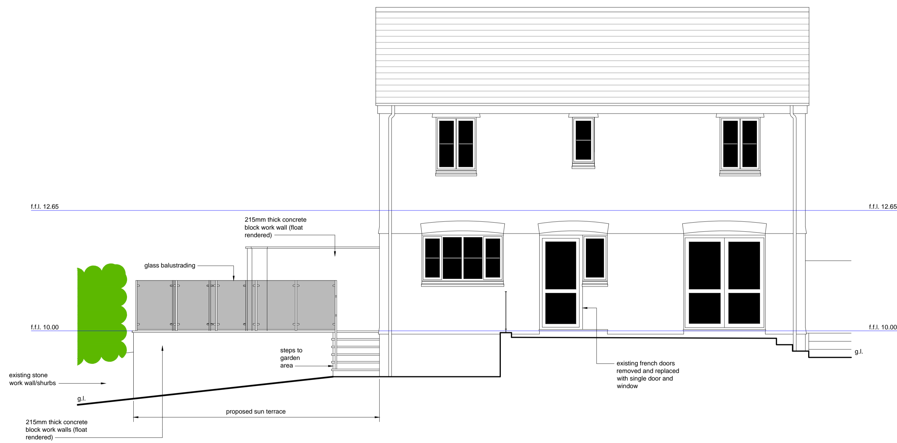
proposed north east elevation