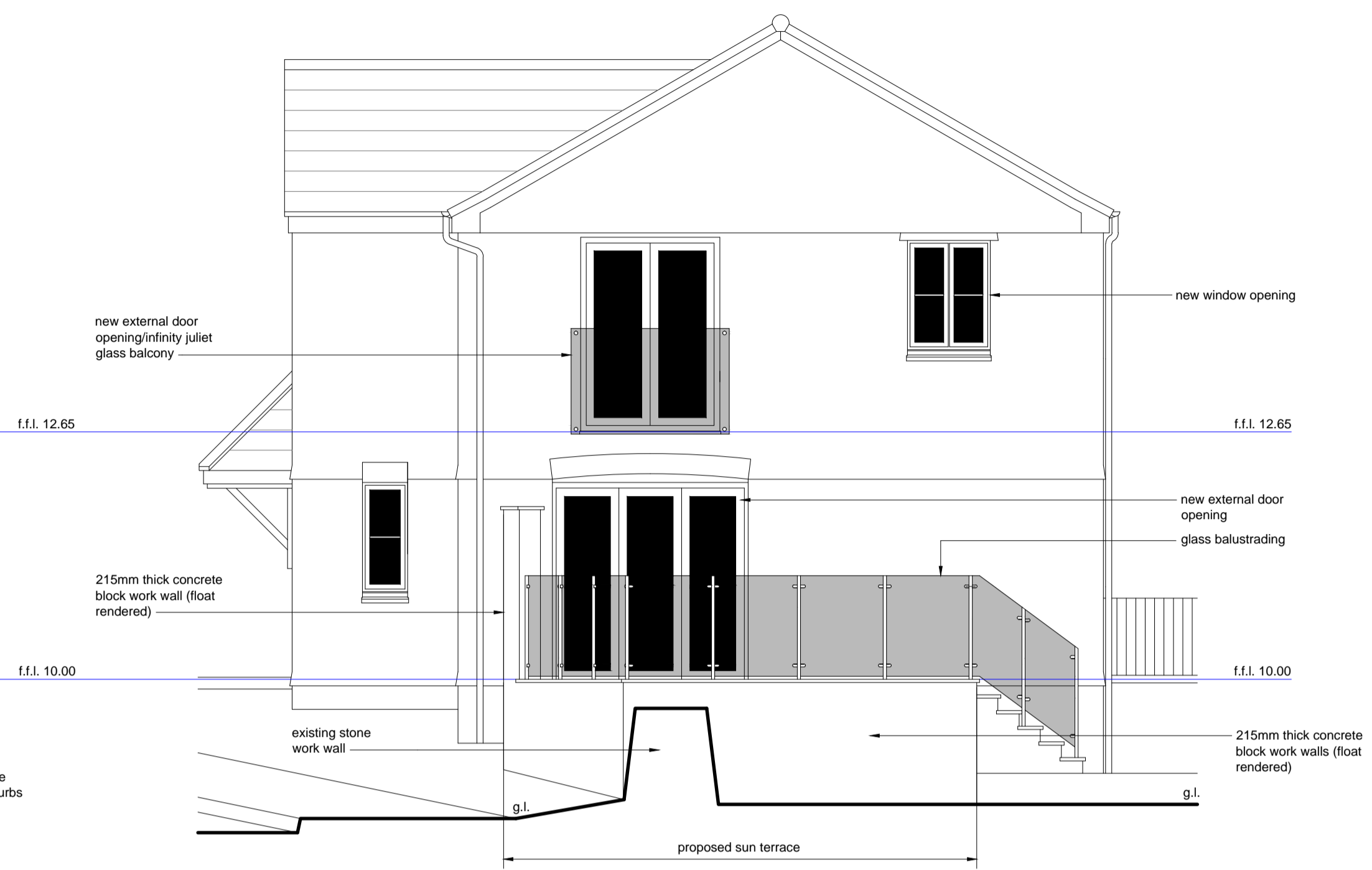
proposed south east elevation