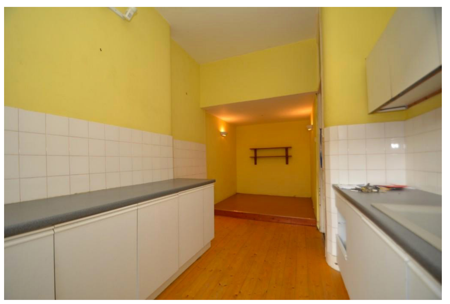
Chimney brest on left to be partially removed. Raised floor and boxed in ceiling to be removed to gain full height