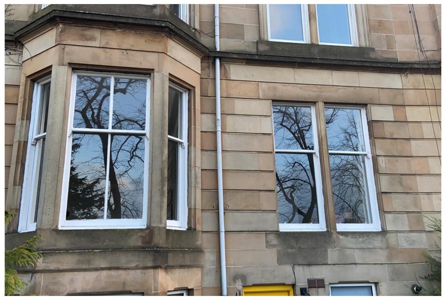
No. 13 Hampden Terrace with original sash windows. Design and proportions to be matched with proposed windows to our site