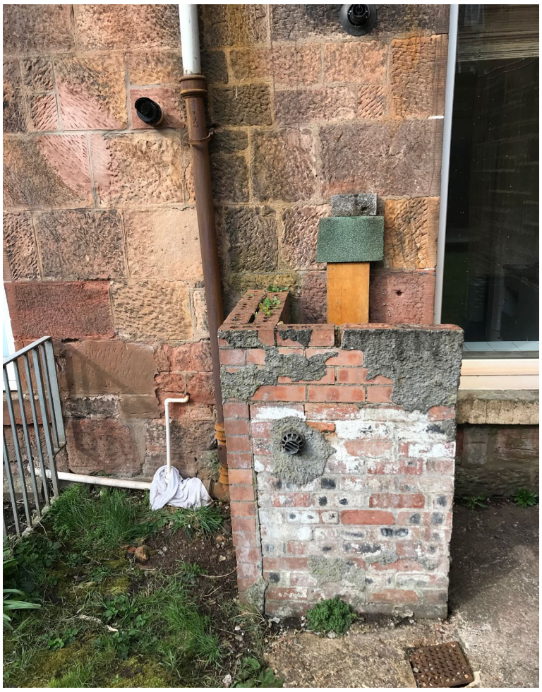
Exterior redundant structure