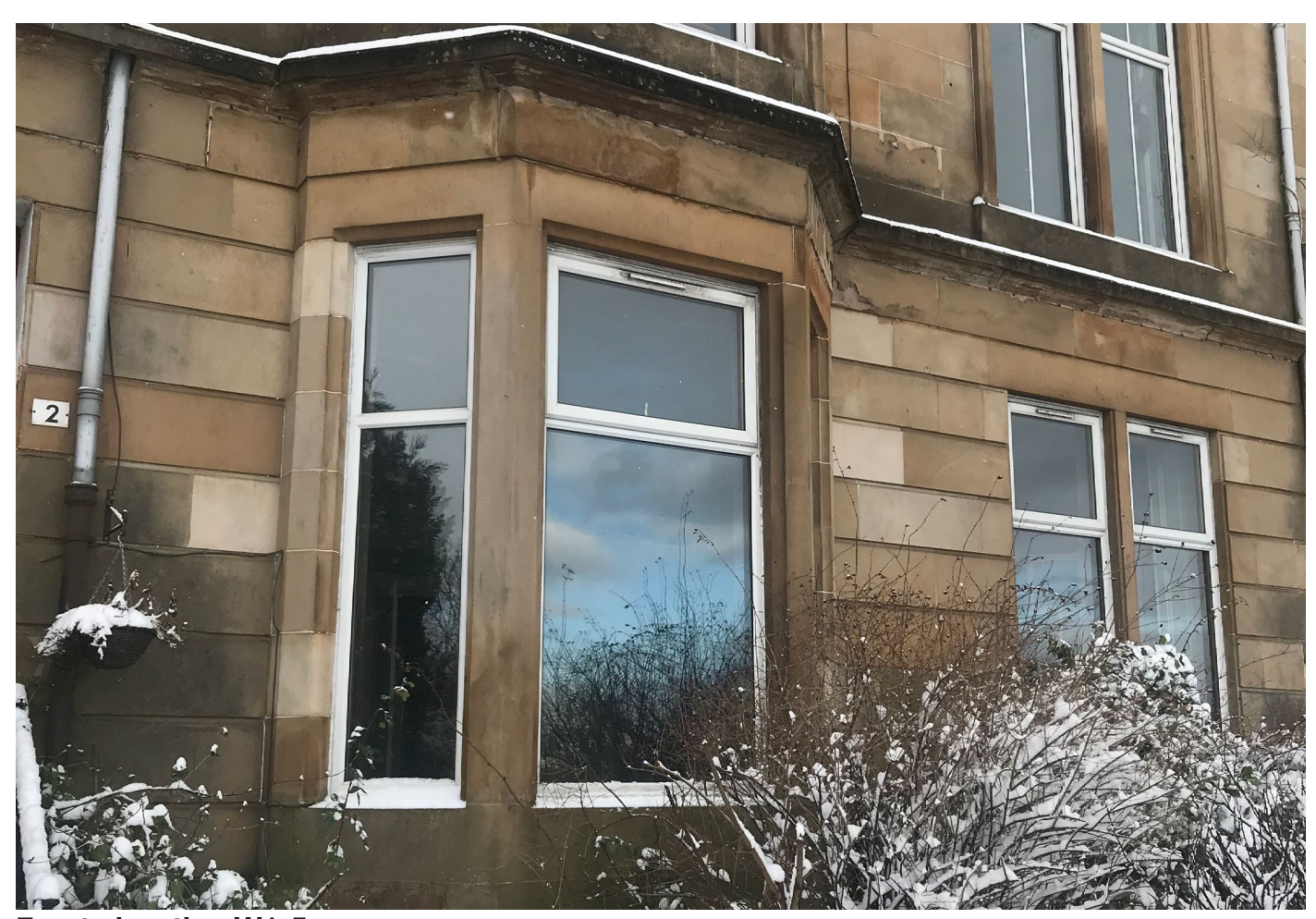
Front elevation W1-5