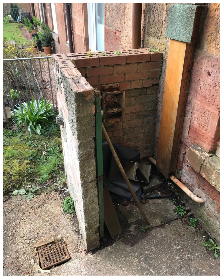
Exterior redundant structure