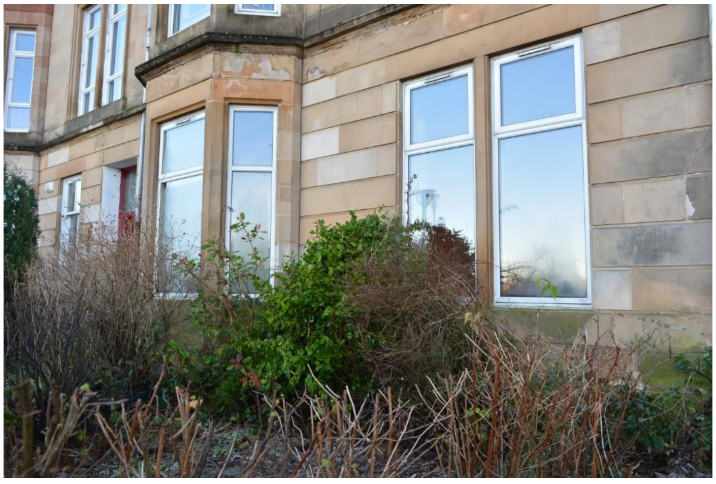
Front elevation W1-5