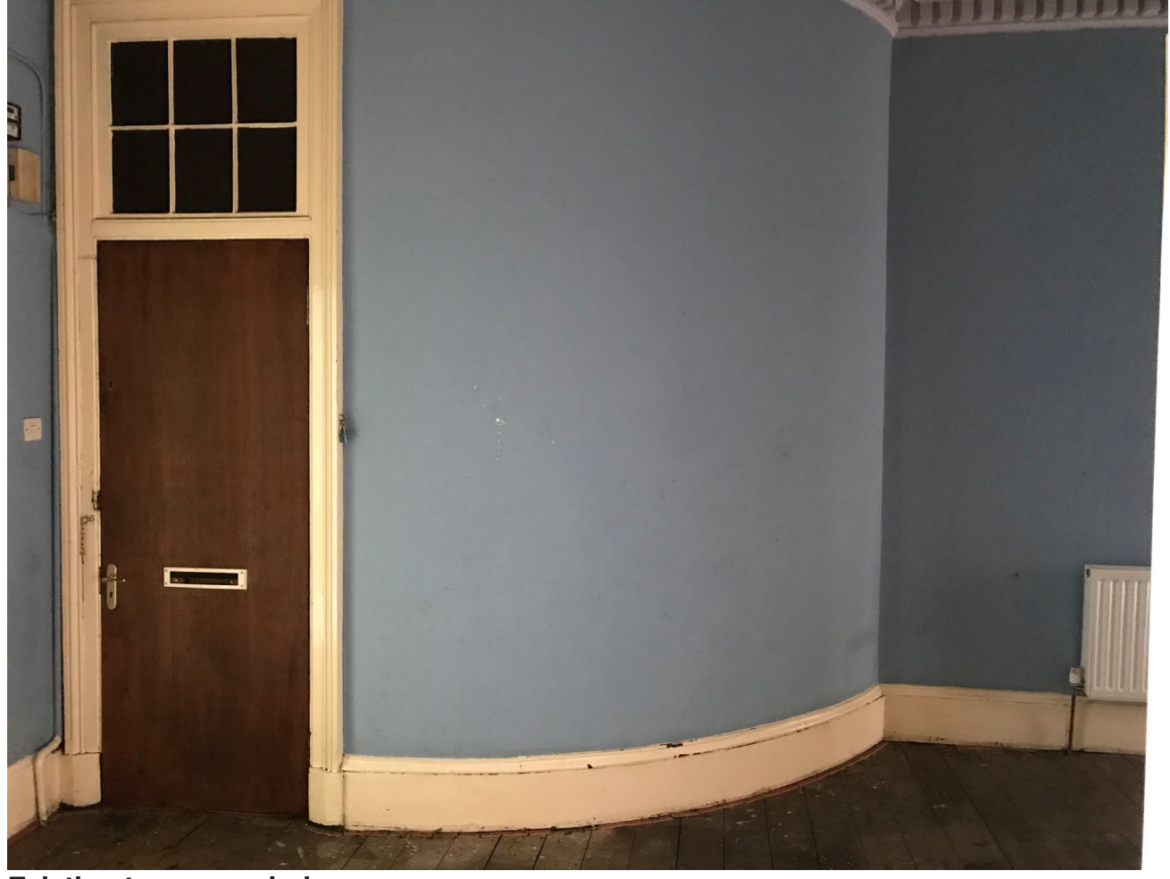
Existing transom window