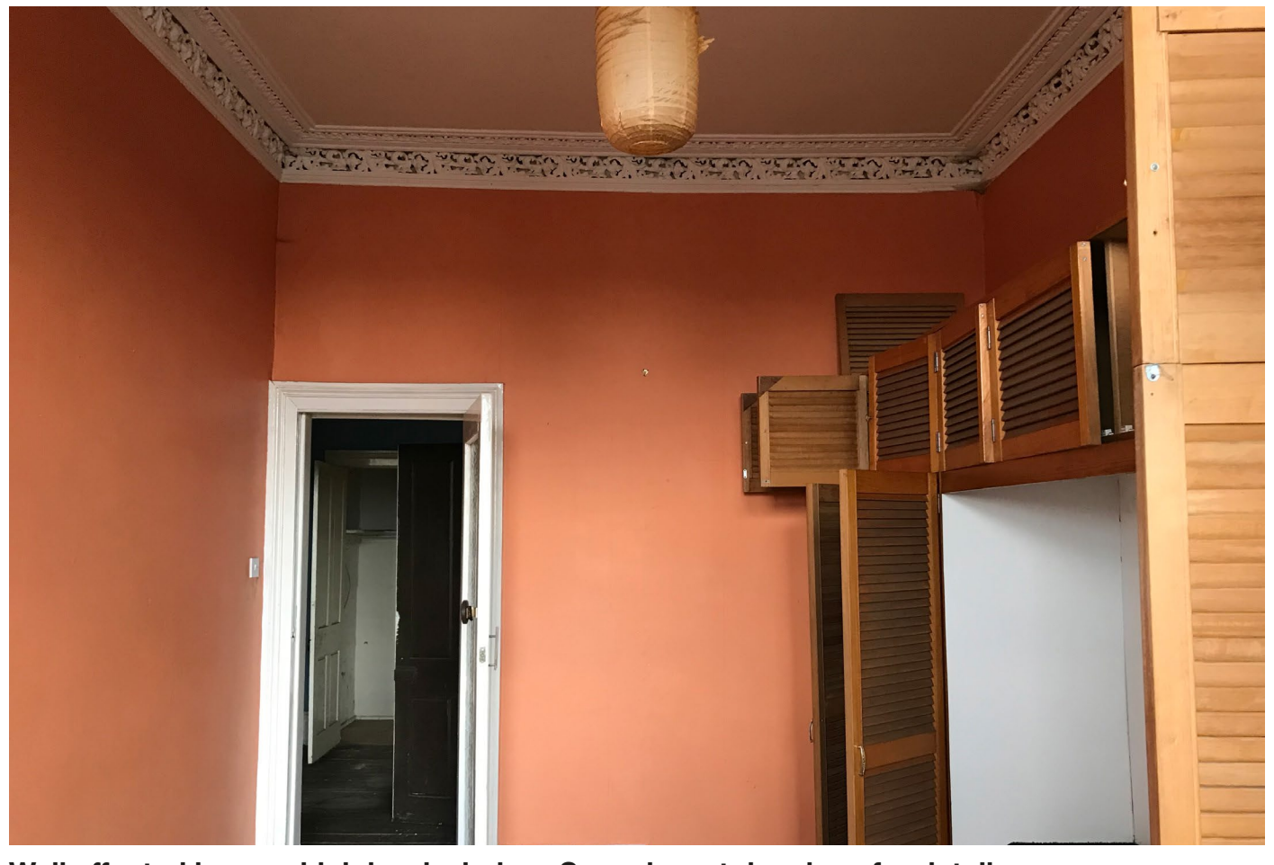
Wall affected by new high level window. See relevant drawings for details