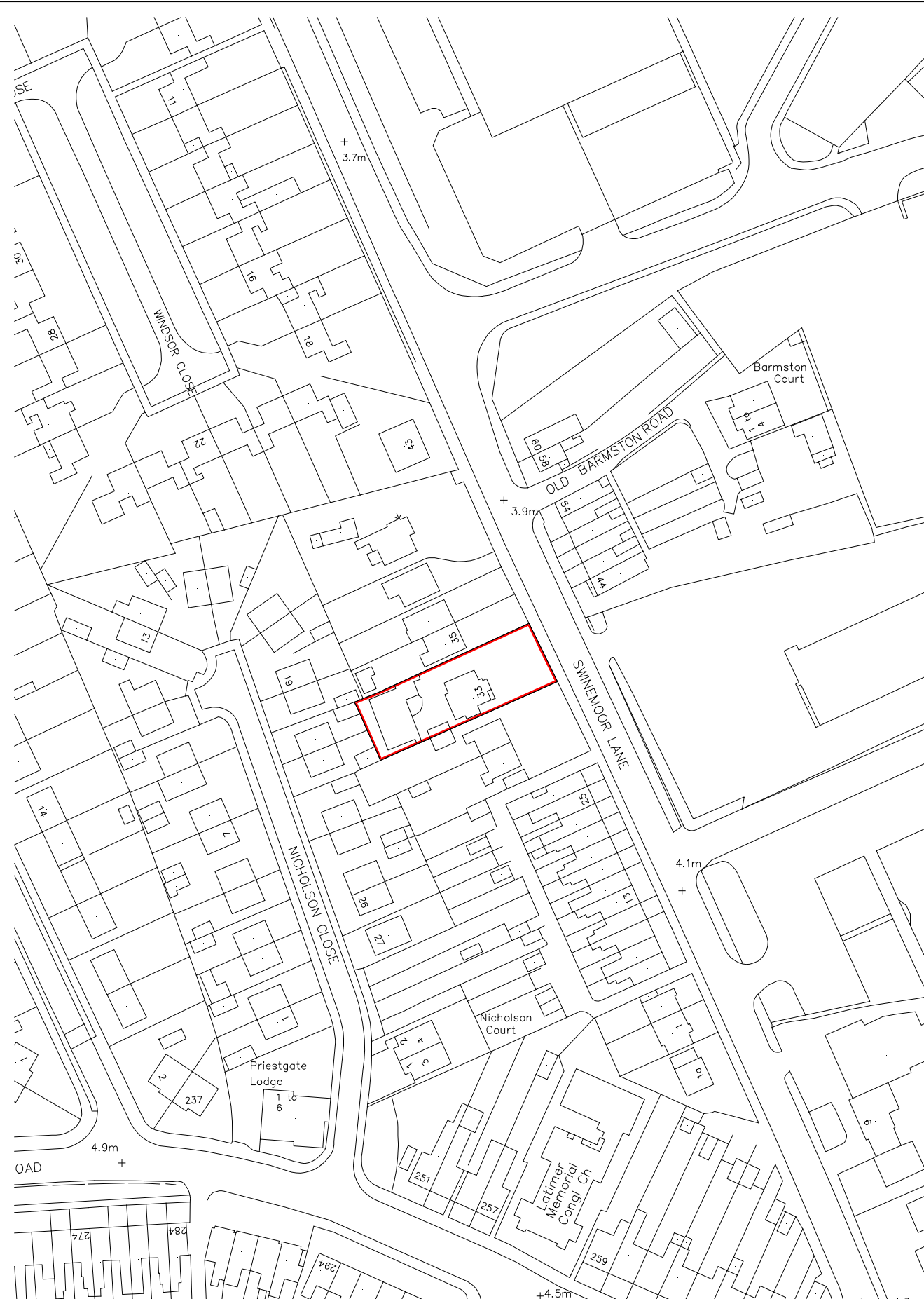
Location Plan Scale - 1:1250