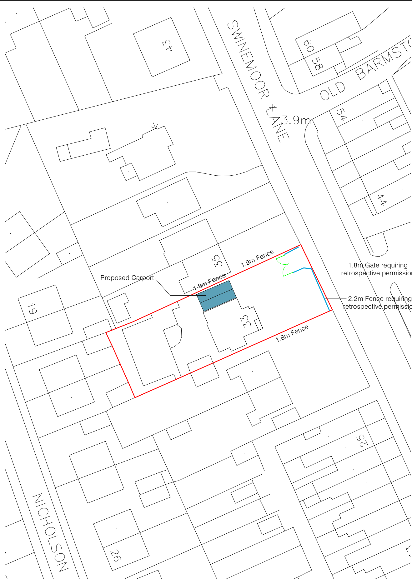
Block Plan Scale - 1:500