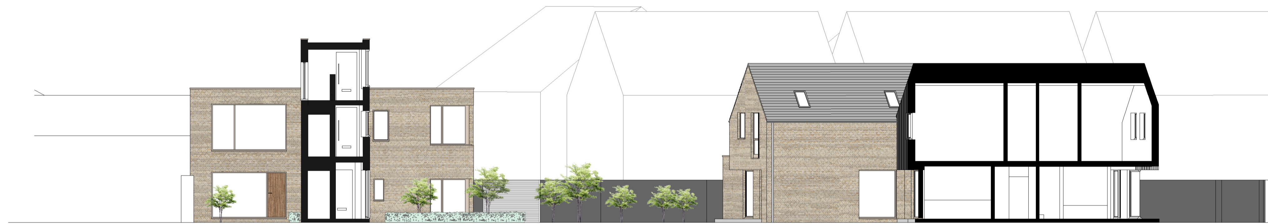
Proposed Section AA - North Elevation