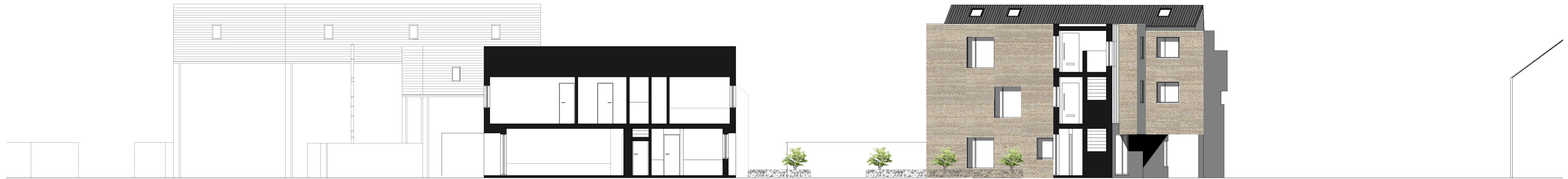
Proposed Section EE - South Elevation