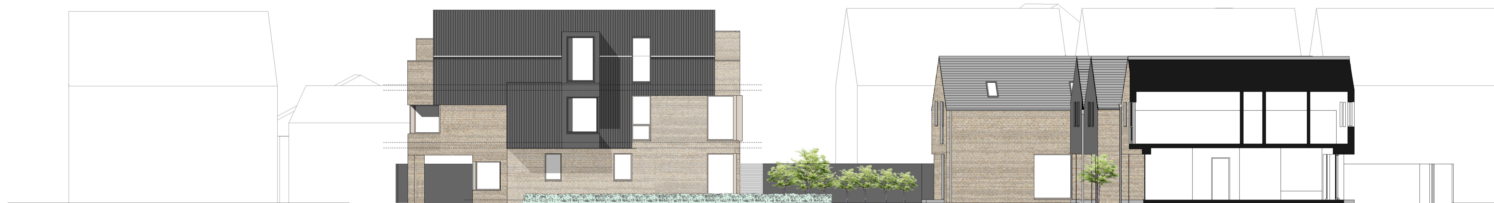
Proposed Section BB