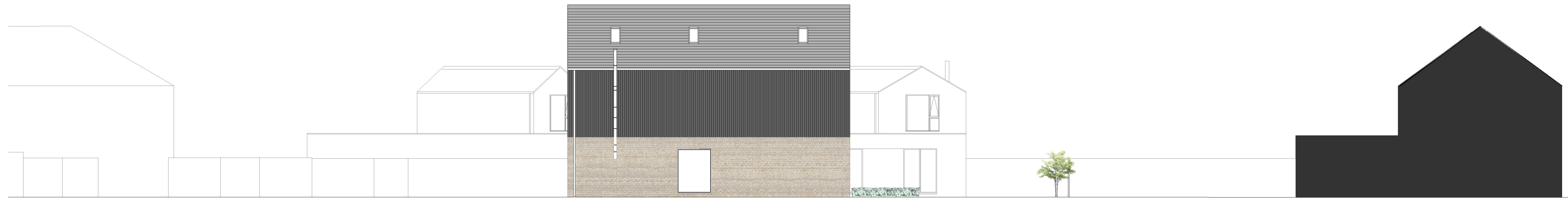
Proposed Section CC