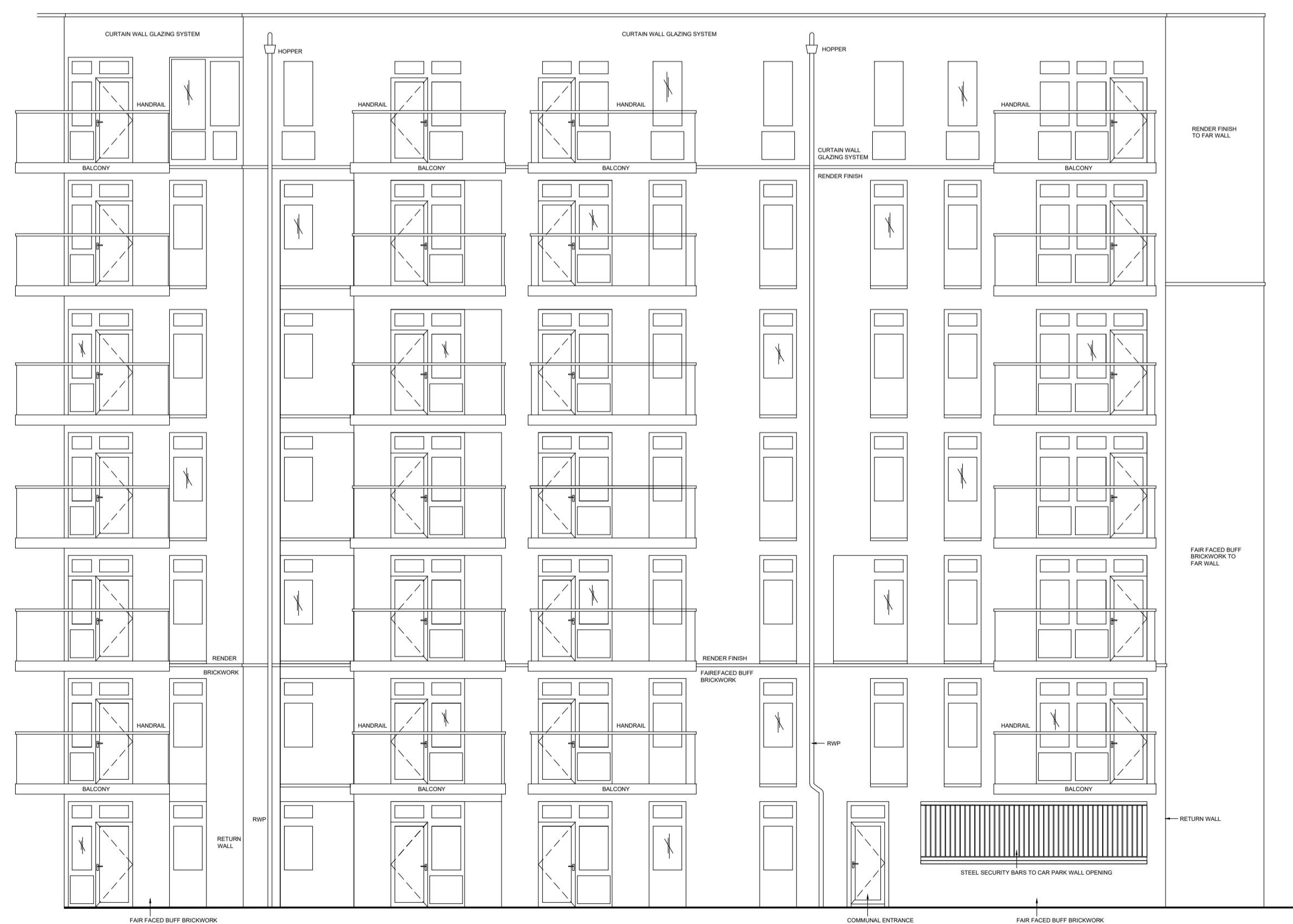
SOUTH ELEVATION AT 'C'