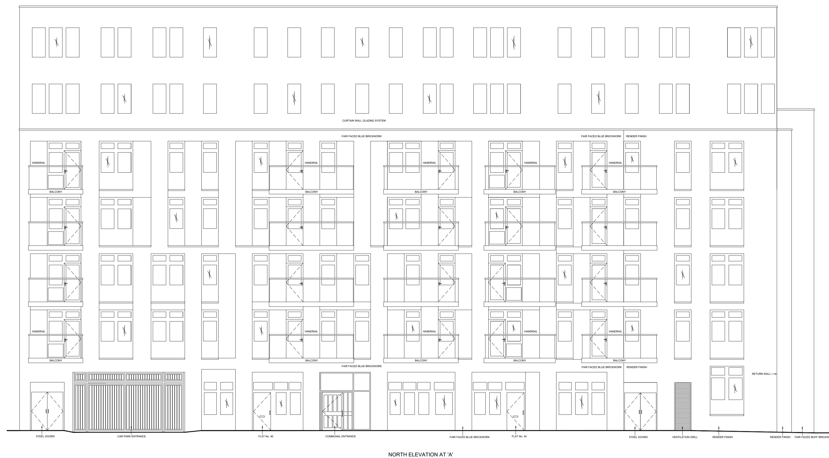
NORTH ELEVATION AT 'A'