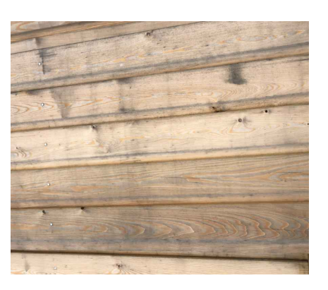
Timber sample of boarding to be used - Larch