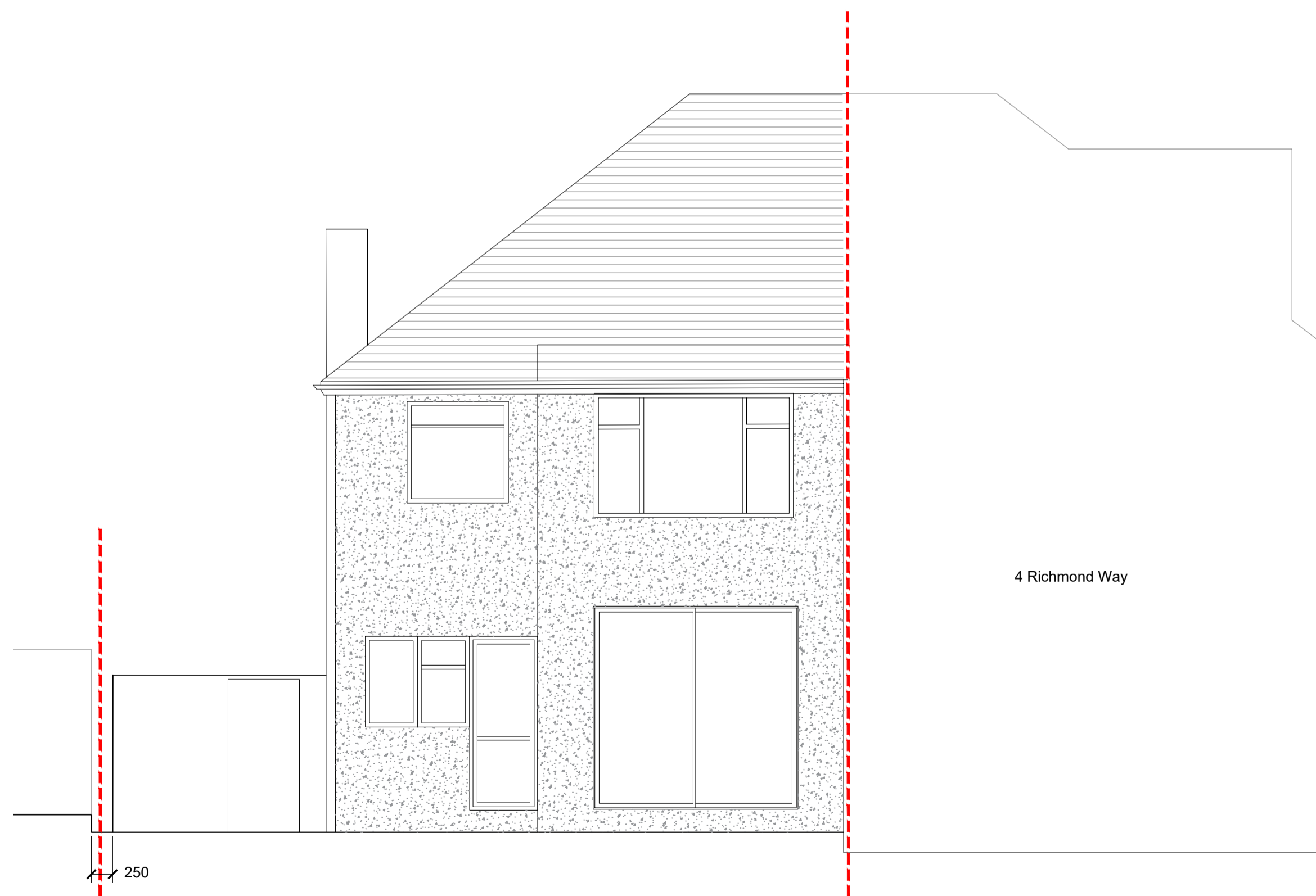
2 Rear Elevation SCALE - 1:50 @ A1