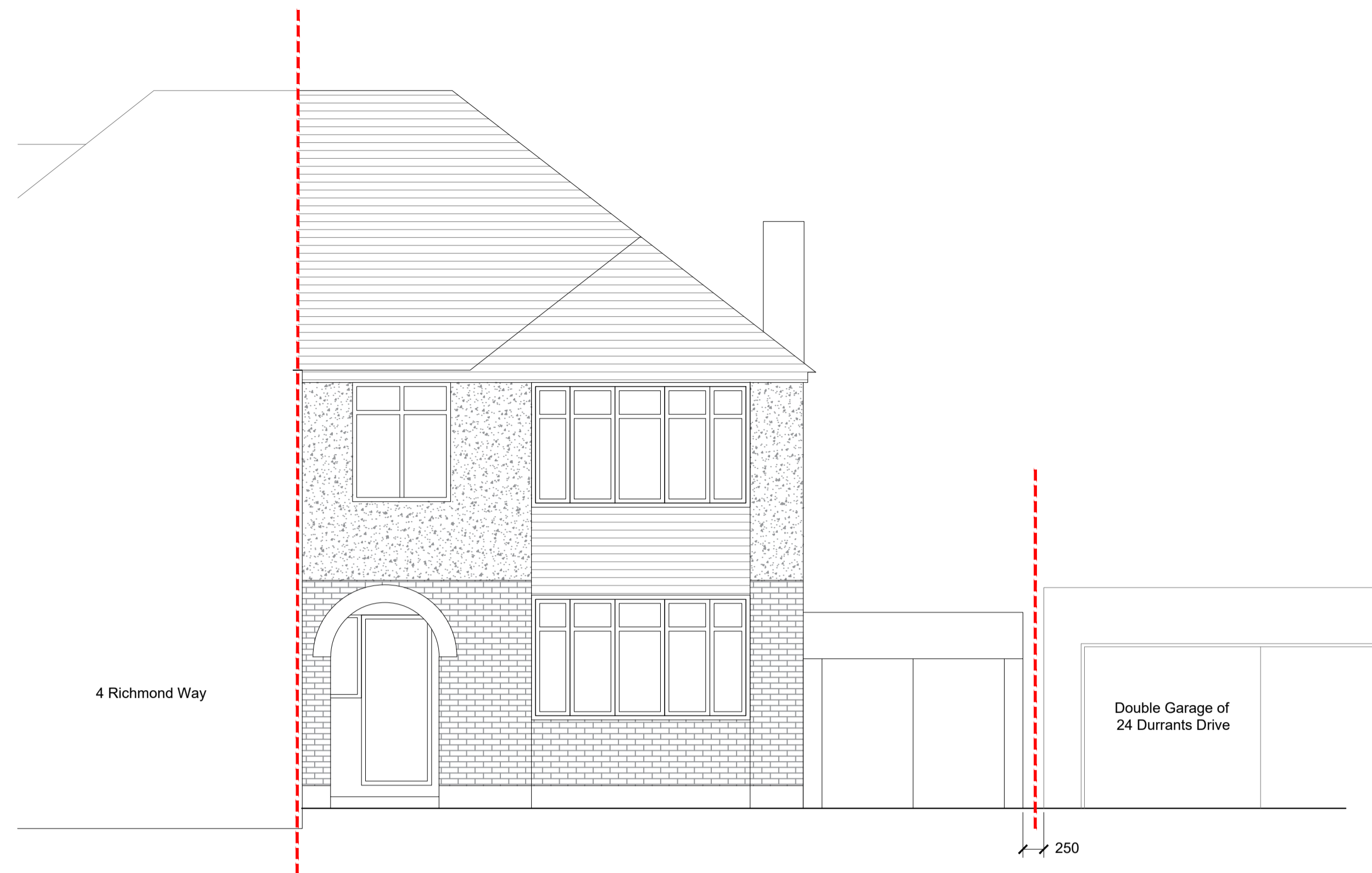
1 Front Elevation SCALE - 1:50 @ A1