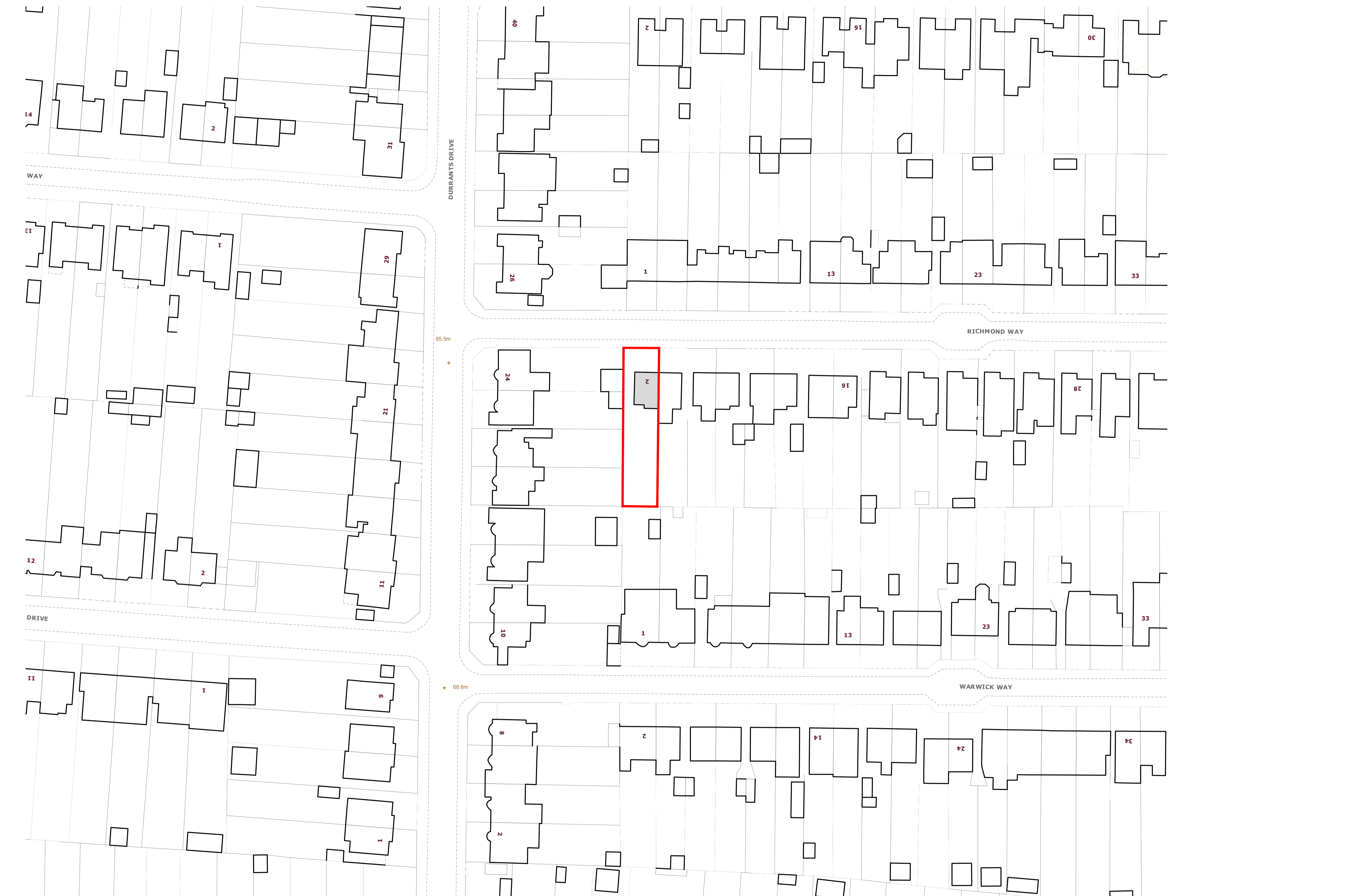
1 Existing Site Plan SCALE - 1:500 @ A1

Scale: Drawing No: Project No: 1:500@A1 LXA-2279-100-EX