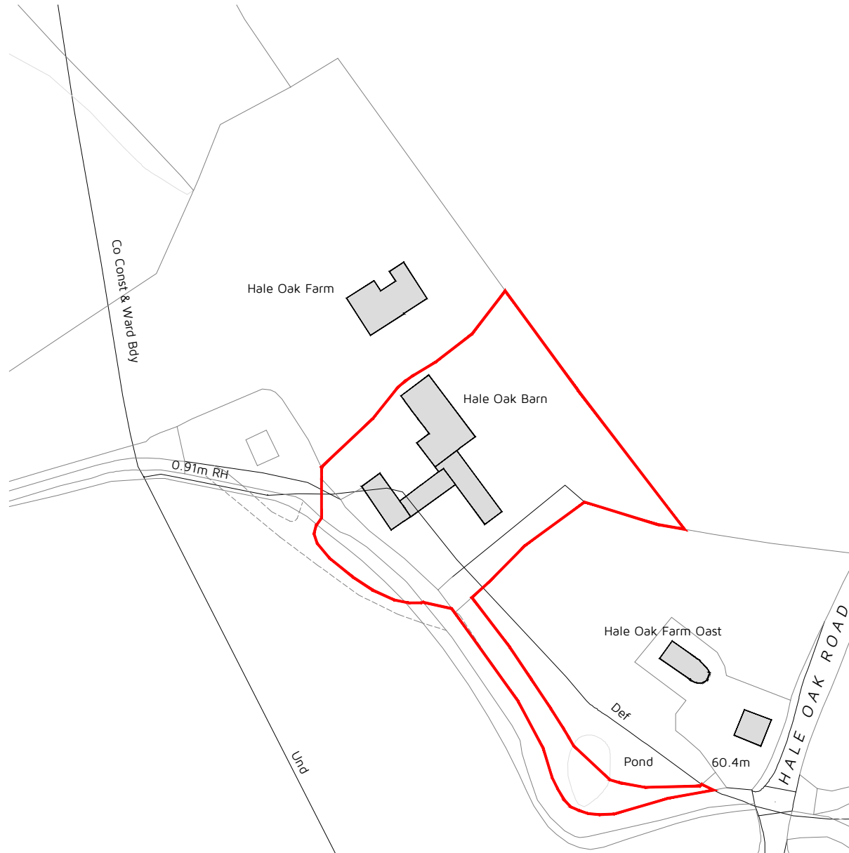
Site Location Plan 1:1250 @ A4