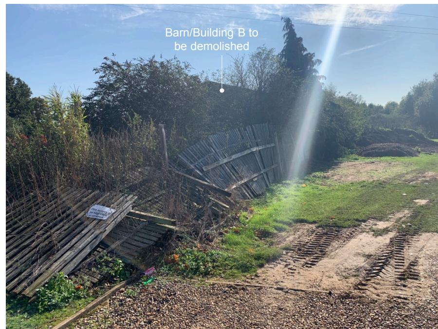
Plate 4: Looking east showing the southern site boundary between Fairways and the golf club. Building B, the Barn to be demolished is indicated in the background.