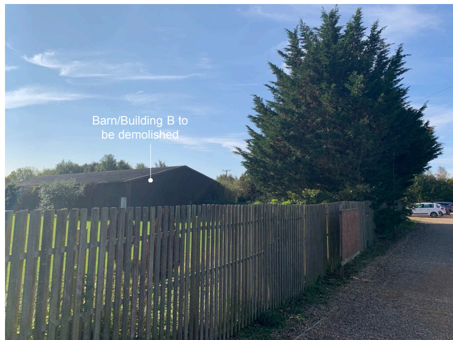
Plate 3: Looking south showing the eastern site boundary between Fairways and the golf club car park and access road. Building B, the Barn to be demolished is indicated.