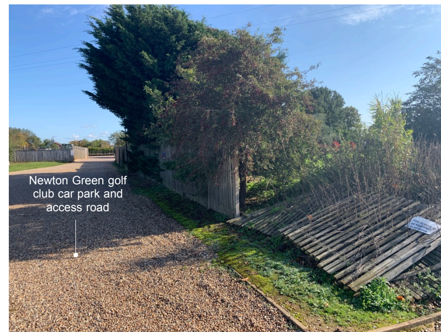
Plate 2: Looking north showing the eastern site boundary between Fairways and the golf club car park and access road.