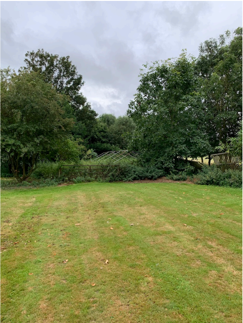
Plate 7: Looking south-east from within the plot showing the overgrown vegetable area and poly tunnel frame with a glimpse view through to the golf course in the background. The open board fencing along the site boundary has collapsed in this area.

Refer to Photograph key Drwg No 401.PS.01 for viewing locations.