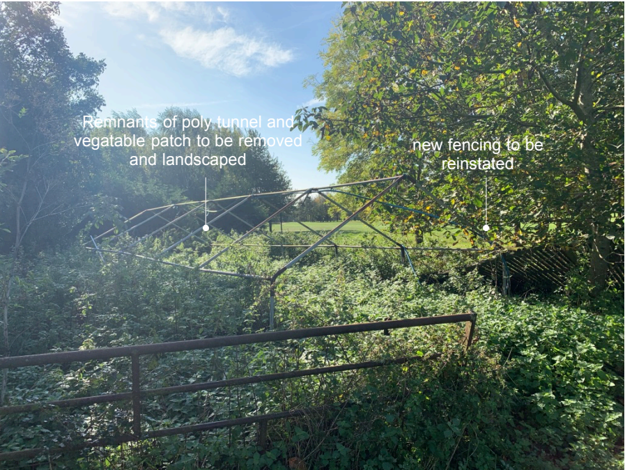
Plate 6: Looking south-east from within the plot showing the overgrown vegetable area and poly tunnel frame with a glimpse view through to the golf course in the background.